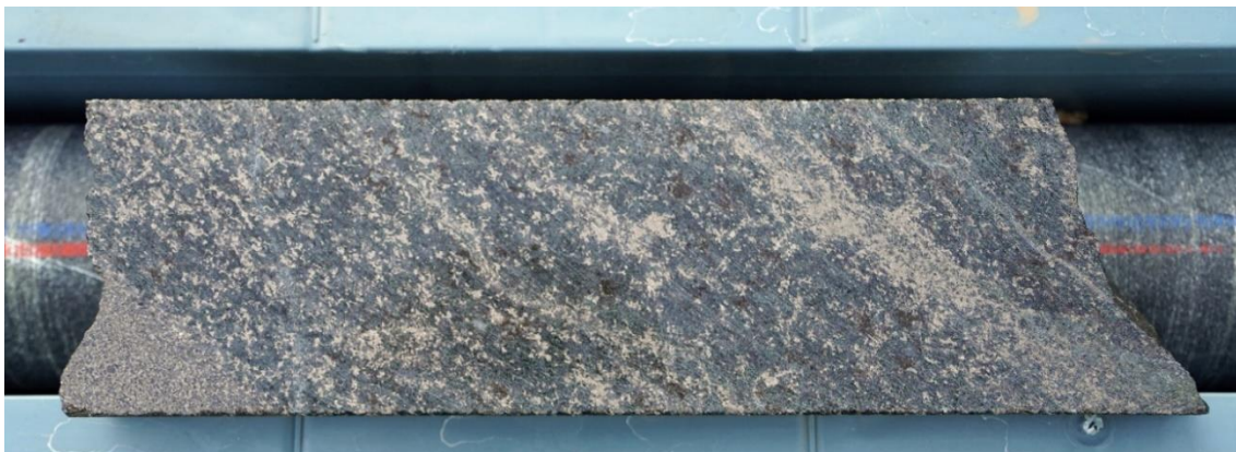
Figure 2 | Matrix sulphide bearing core from hole PS412

Future Metals NL ("Future Metals" or the "Company", ASX | AIM: FME), is pleased to provide an update on its ongoing drilling programme at its wholly owned Panton project ("Panton" or "the Project").