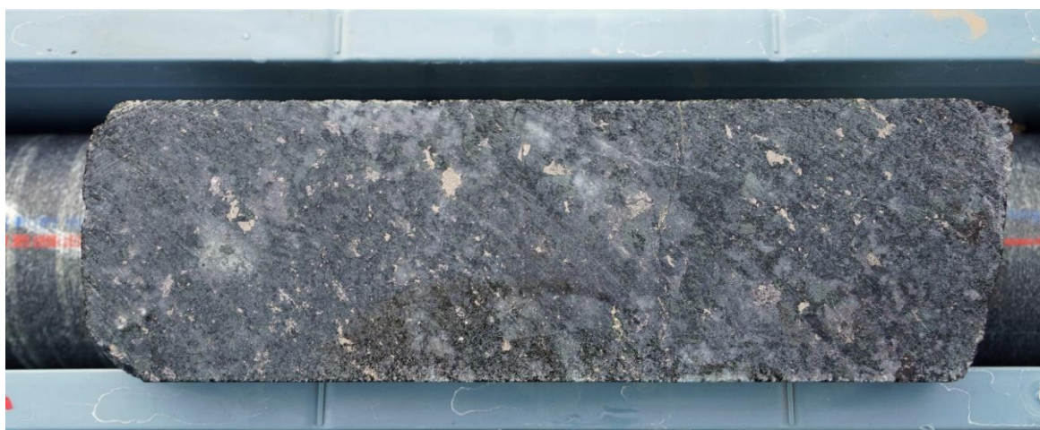
Figure 3 | Disseminated sulphide bearing core from PS412

The Company has commenced drilling into the keel position into the north and will shortly begin running DHEM on each of the completed drill holes to identify further targets, and complete ground-based EM surveys over the gravity anomaly areas.