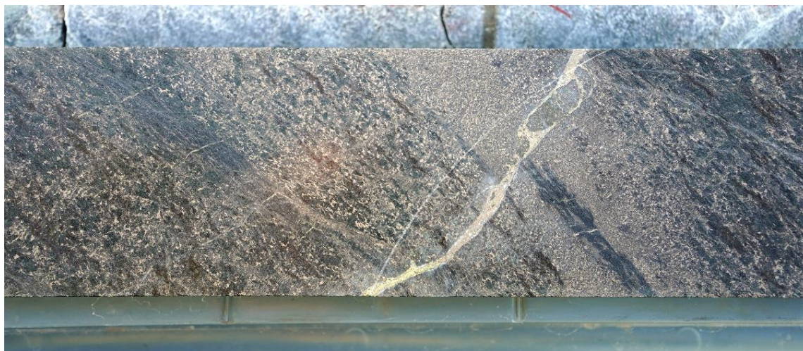
Figure 1 | Semi-massive sulphide bearing core from hole PS411