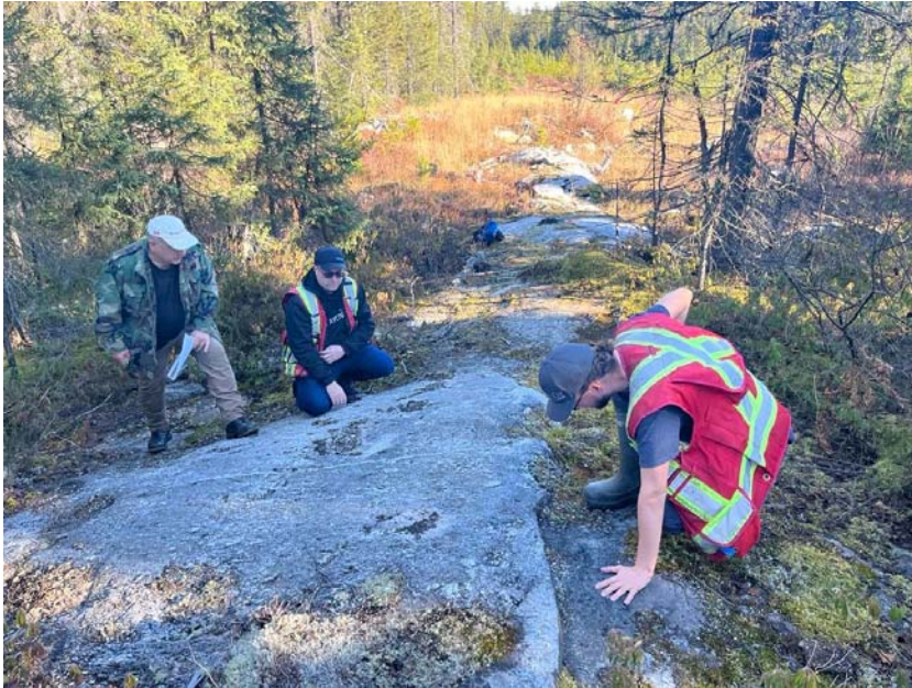
Figure 2: Vallée Project – outcropping pegmatite