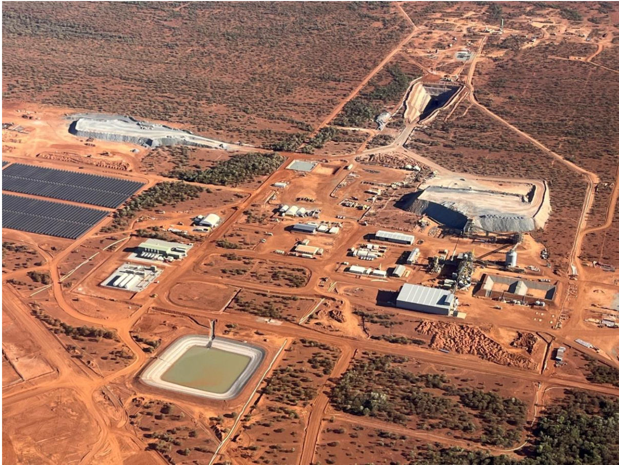
Figure 4 – Abra site (Photo 11 November 2022).

The Board of Directors of Galena authorised this announcement for release to the market.