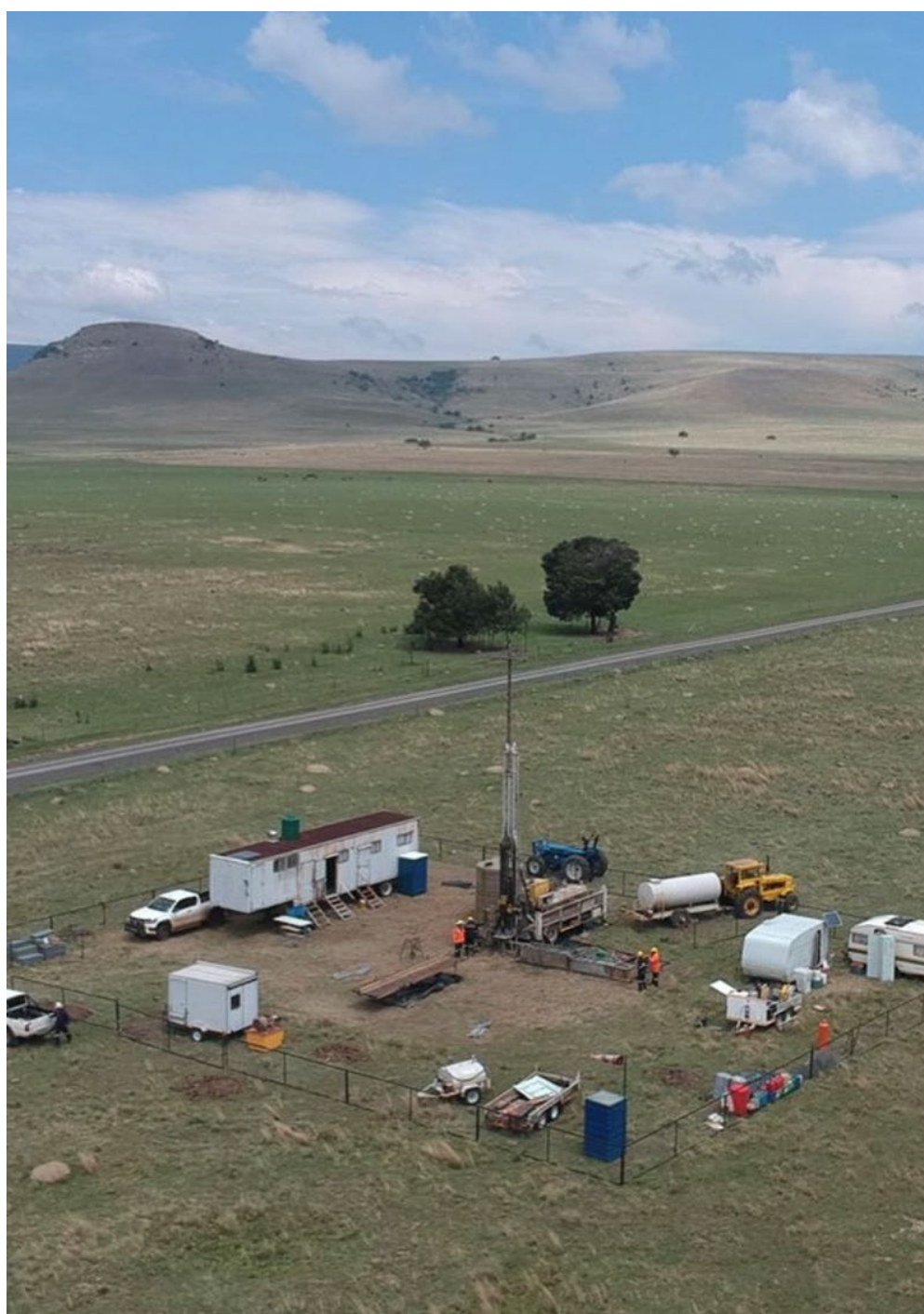
Figure 2 - Core well 270-06C being drilled in the southern most region of the Company's granted rights

The Karoo sequences are known to dip southwards in this region and we therefore expect to encounter deeper terminal depths in our southernmost boreholes, with concurrently higher pressures and gas flow rates versus our discoveries to the north. This core hole (which will be followed by others in the next few months) is being drilled to both test this theory as well as provide a new facet to our eventual production plans.