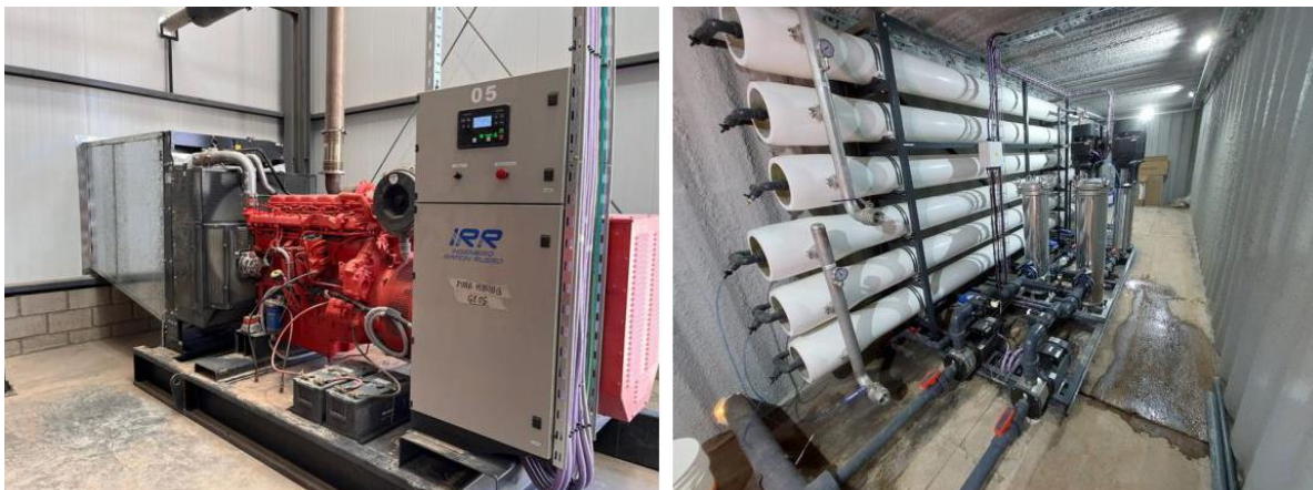
Figures 7-8. Rincon Lithium Project – 2,000tpa Operation Commissioning Works