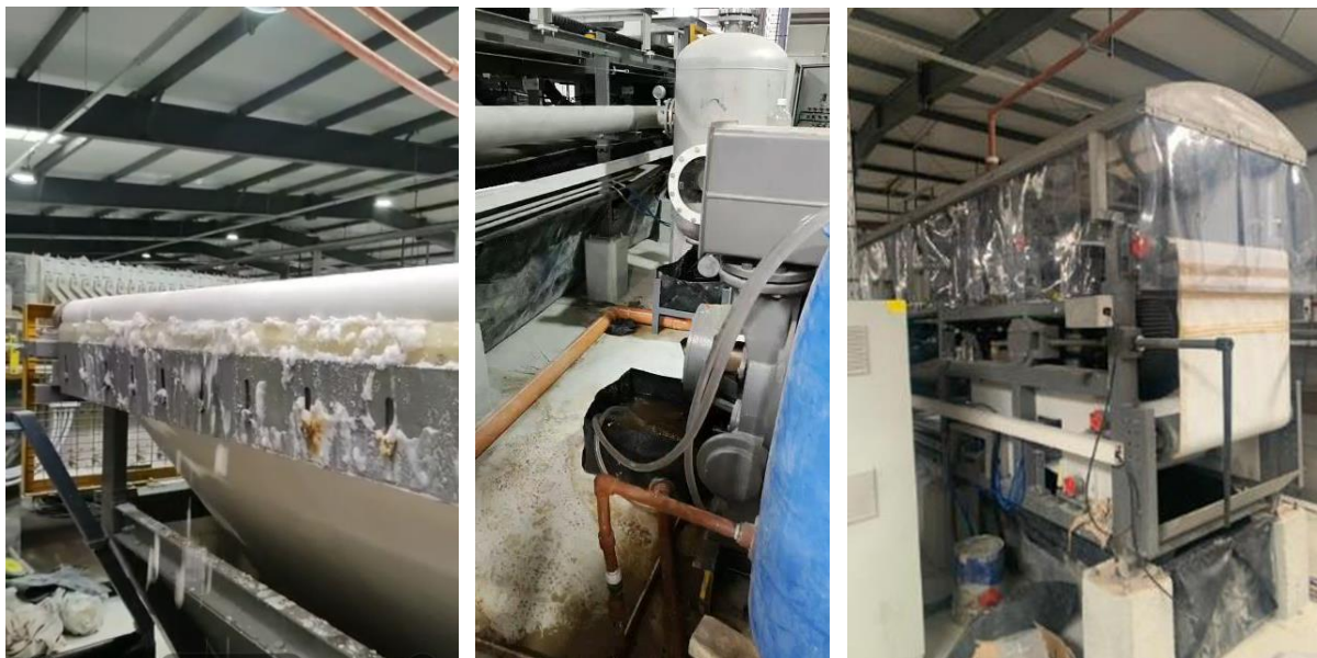
Figures 1-3. Rincon Lithium Project – 2,000tpa Operation Commissioning & Production Test-Works

The Company is progressing commissioning and production test-works to produce battery quality lithium carbonate product. Current plant commissioning works have successfully produced primary lithium product, which is being processed through multiple stages to produce battery quality lithium carbonate product.