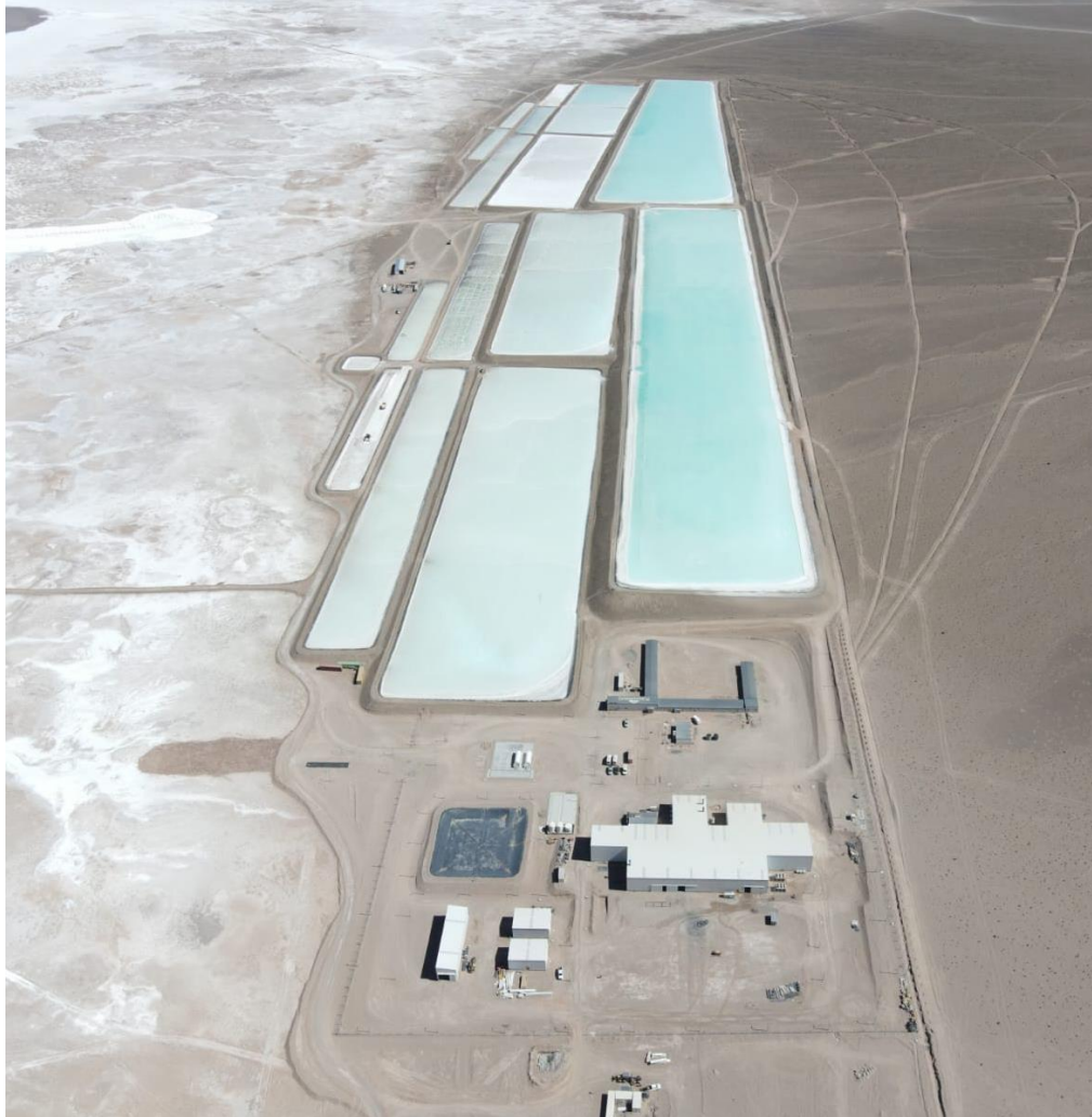
Figure 4. Rincon Lithium Project – 2,000tpa Operations Site