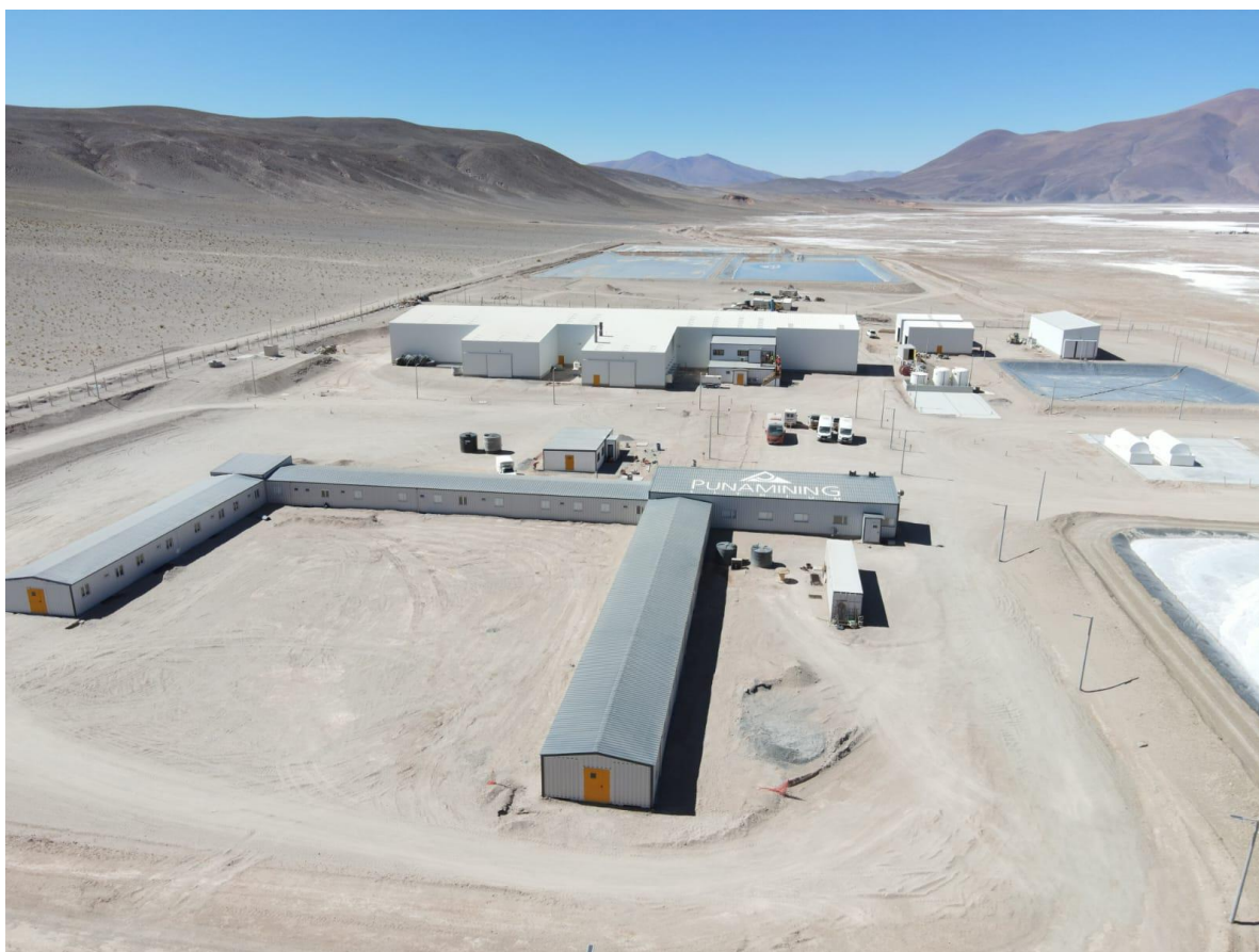
Figure 9. Rincon Lithium Project – 2,000tpa Operations Site