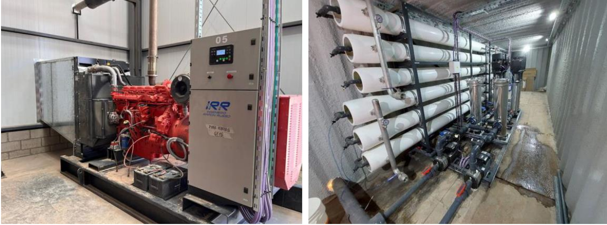
Figures 7-8. Rincon Lithium Project – 2,000tpa Operation Commissioning Works