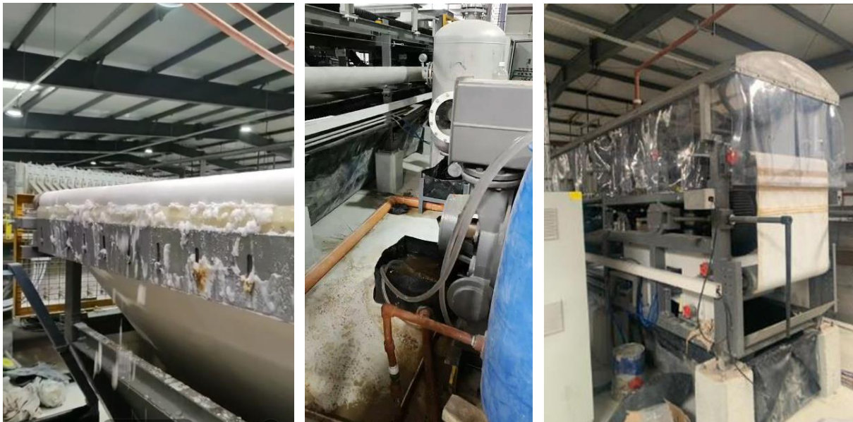
Figures 1-3. Rincon Lithium Project – 2,000tpa Operation Commissioning & Production Test-Works

The Company is progressing commissioning and production test-works to produce battery quality lithium carbonate product. Current plant commissioning works have successfully produced primary lithium product, which is being processed through multiple stages to produce battery quality lithium carbonate product.