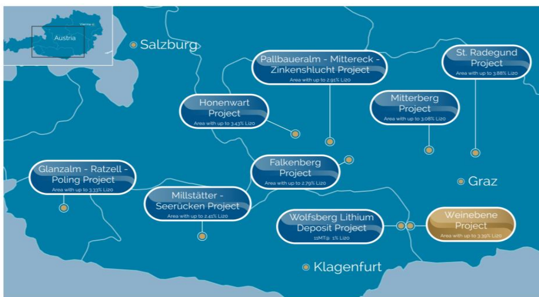
Figure 1 – Weinebene Lithium Project Location

EVR holds an 80% interest in Subsidiary Jadar Lithium GmbH ( Jadar Lithium ), the holder of the Weinebene and Eastern Alps Projects which lies 20km to the east of the Company's Wolfsberg Project (refer figure 1).