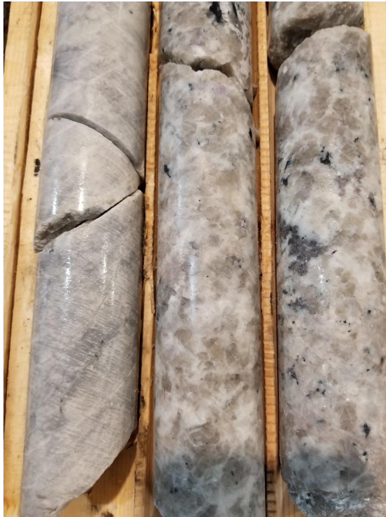
Figure 5 – Close up of drill core from AD-22-008