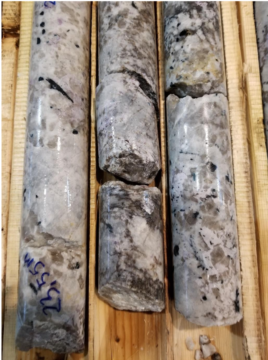
Figure 4 – Close up of drill core from hole AD-22-005