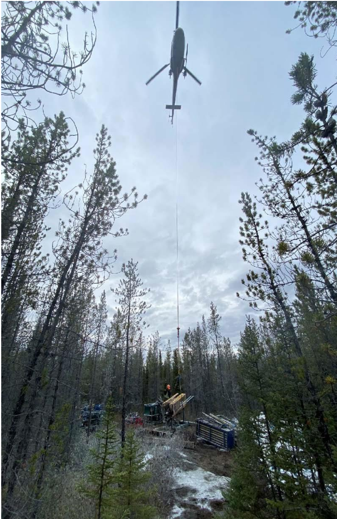
Figure 7 - RC Rig being moved into position on a new hole at Cancet