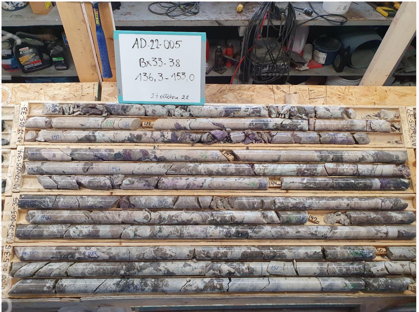
Figure 3 – Core Samples from hole AD-22-005, Adina