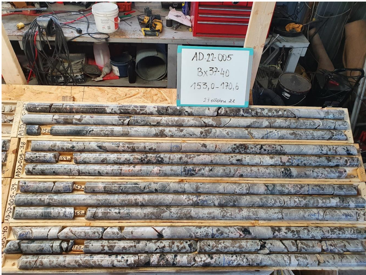
Figure 2 – Core Samples from hole AD-22-005, Adina