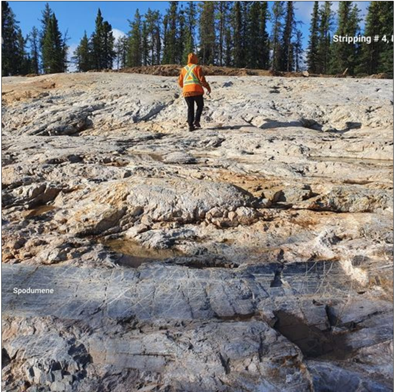
Figure 3: North view of the main dyke at Cancet showing spodumene crystals exposed during stripping. 3