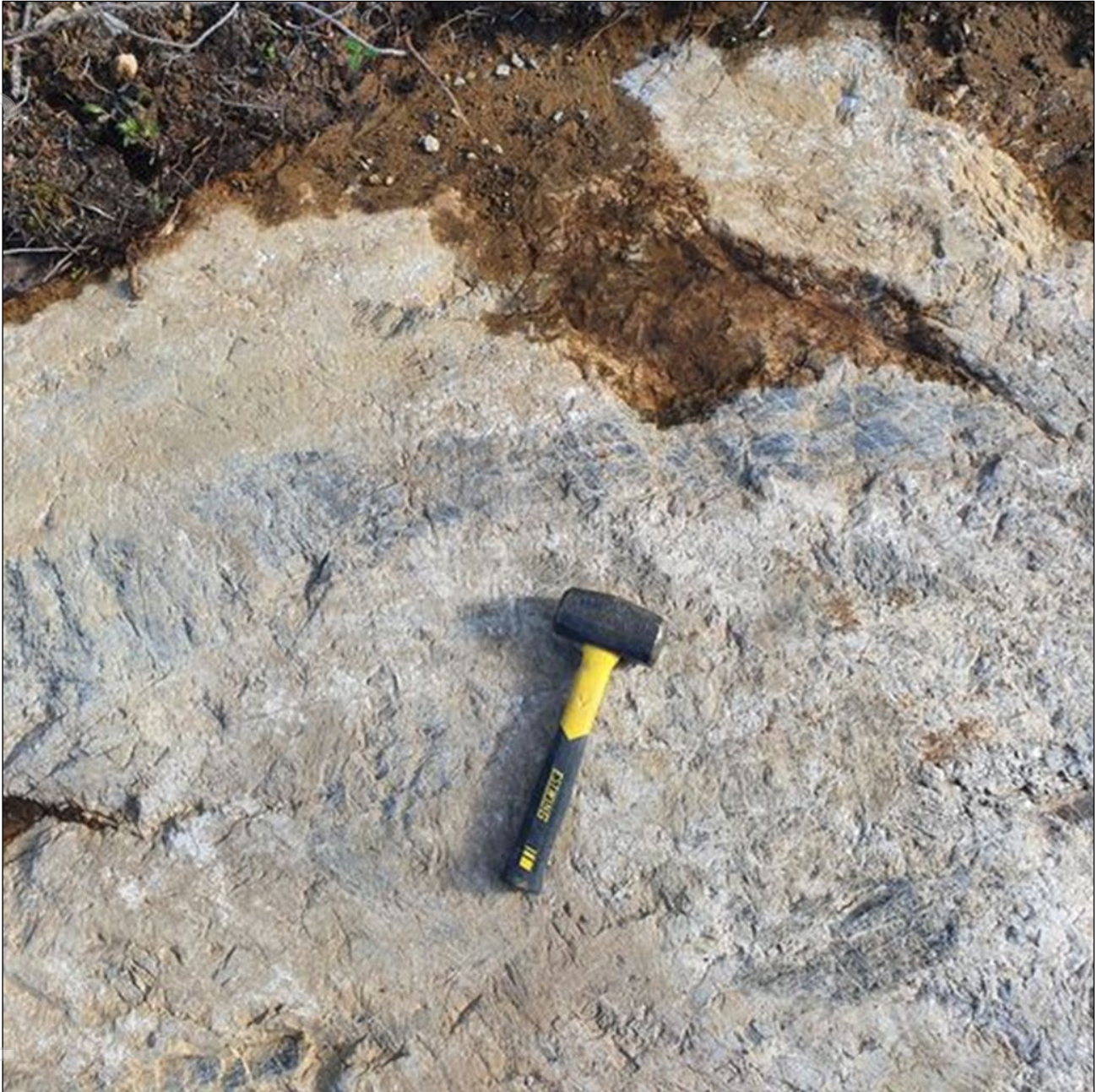
Figure 4: Spodumene crystals exposed during stripping of the Cancet main dyke.