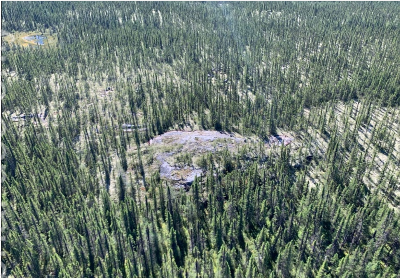
Figure 8 – The new Jamar Discovery outcrop viewed from the air.