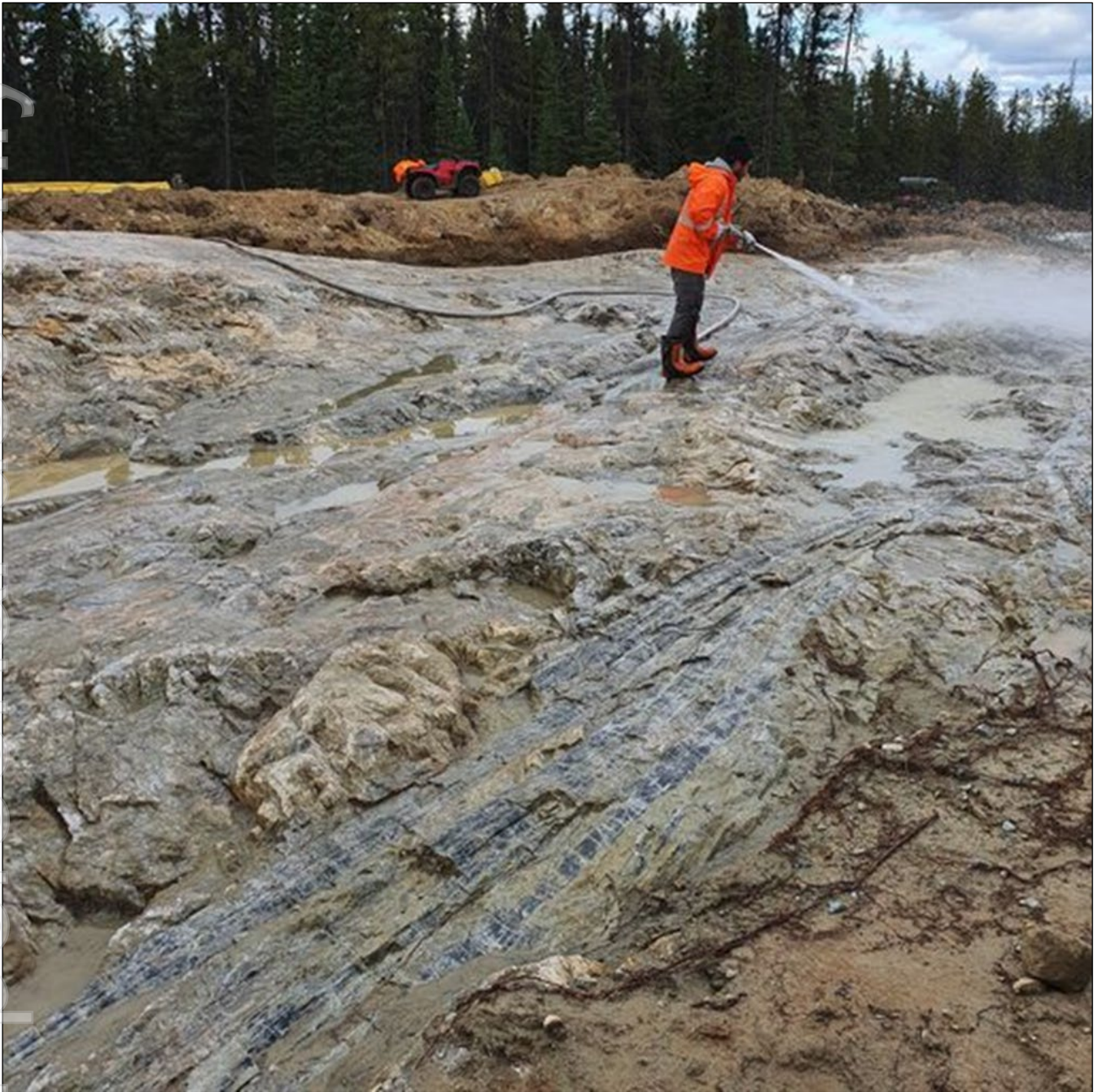
Figure 6: North-east view of the main dyke at Cancet showing spodumene crystals exposed during stripping.