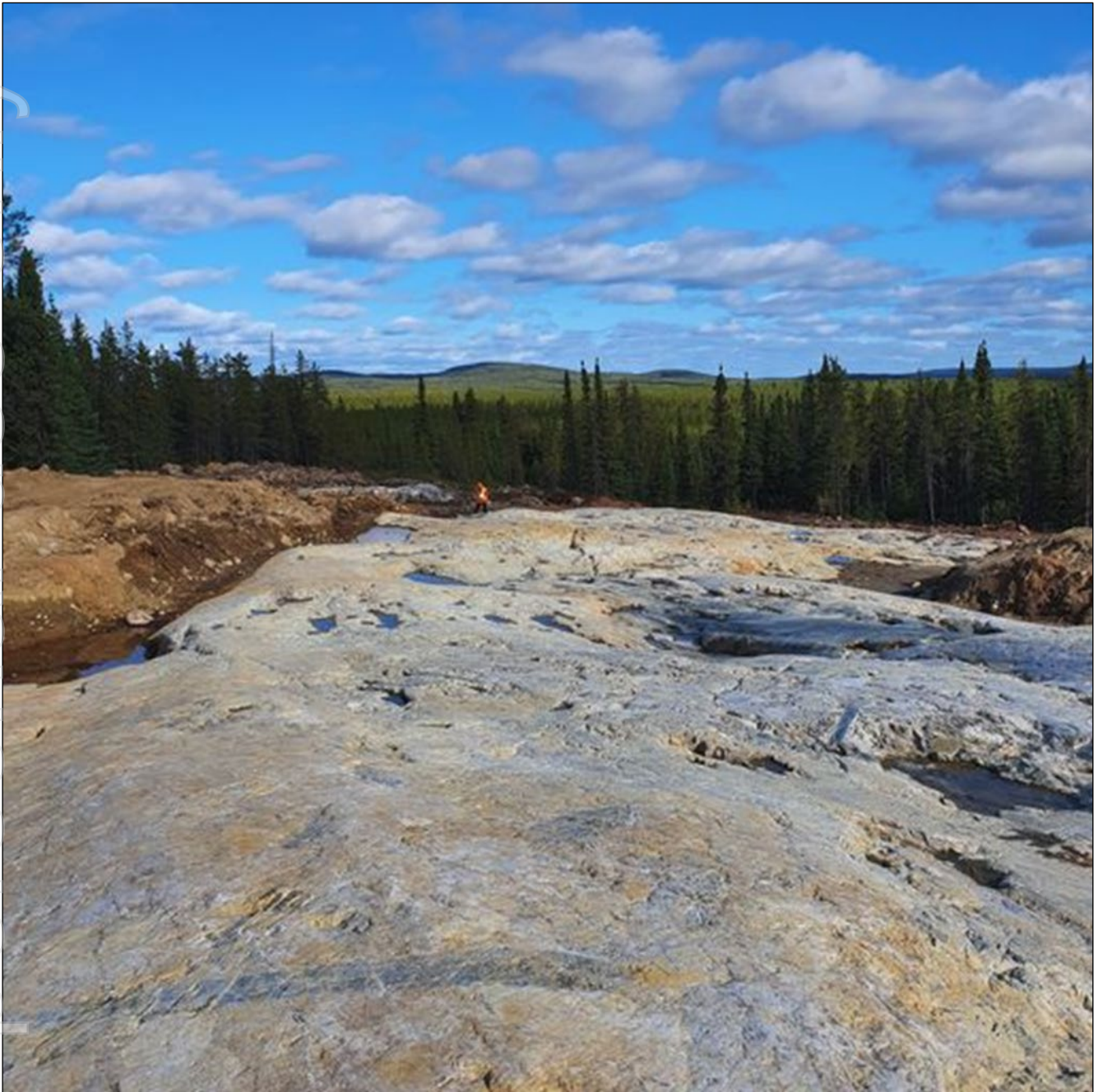
Figure 5: East view of the main dyke at Cancet showing spodumene crystals exposed during stripping.