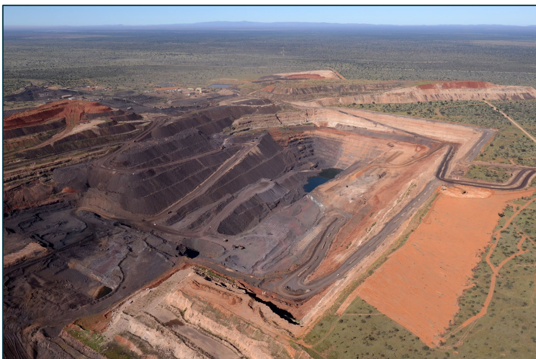
Figure 1: Tshipi Borwa Mine Pit

The Tshipi Borwa Manganese Mine is a long-life, open pit manganese mine with an integrated ore processing plant located in the Kalahari Manganese Fields in the Northern Cape Province of South Africa.