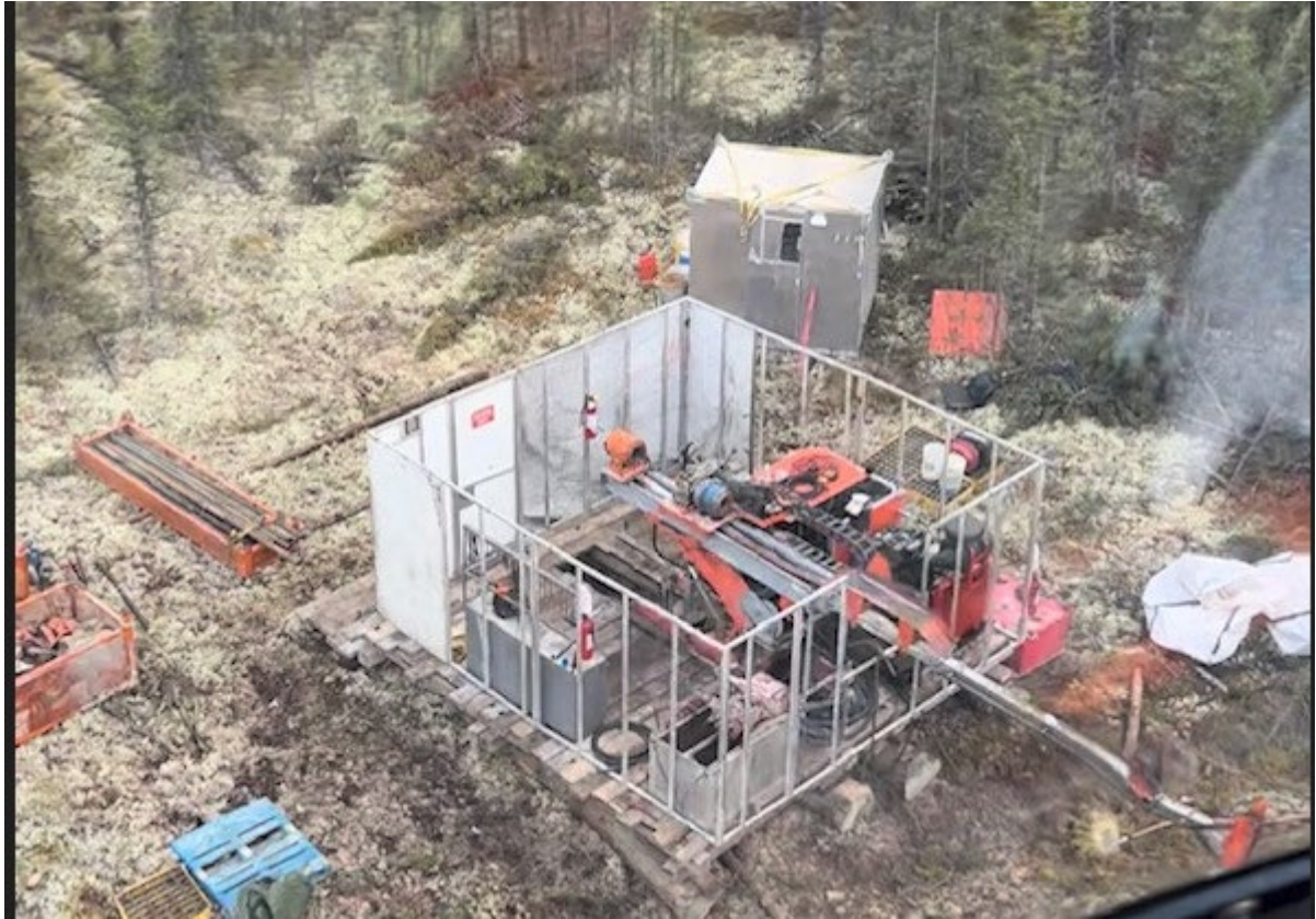
Figure 4: Adina diamond rig being set up