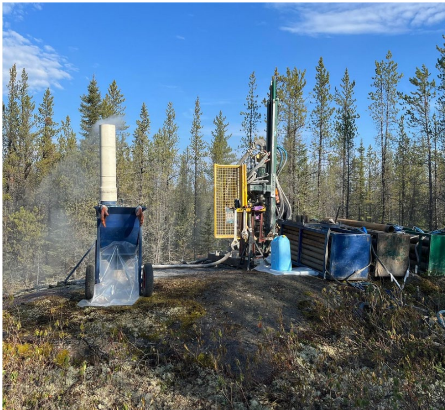
Figure 2: RC drill rig assembled for drilling