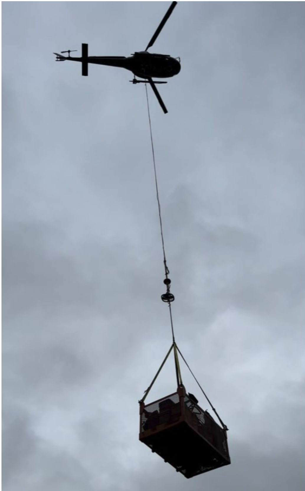
Figure 3: Diamond rig being delivered to Adina