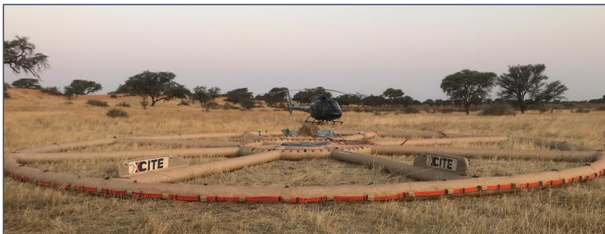
Figure 1: Photo image of helicopter being readied at Bitterwasser for the survey

Arcadia Minerals Ltd (ASX:AM7, FRA:8OH) (Arcadia or the Company), the diversified exploration company targeting a suite of projects aimed at Tantalum, Lithium, Nickel, Copper and Gold in Namibia, is pleased to announce that it has commissioned NRG Exploration CC, a South African specialist geophysical operator, to conduct a regional scale electromagnetic survey over the Bitterwasser Lithium Brines Project in Namibia.