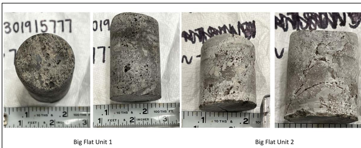
Figure 3: Pictures of Diamond Core from wells that sampled the Mississippian Units.

As more data is collected, the Exploration Target may be further refined to make the estimation more accurate. This data will include the collection of core from which specialist laboratories in the USA can determine/calculate numerous properties of the rock units, see Table 2.