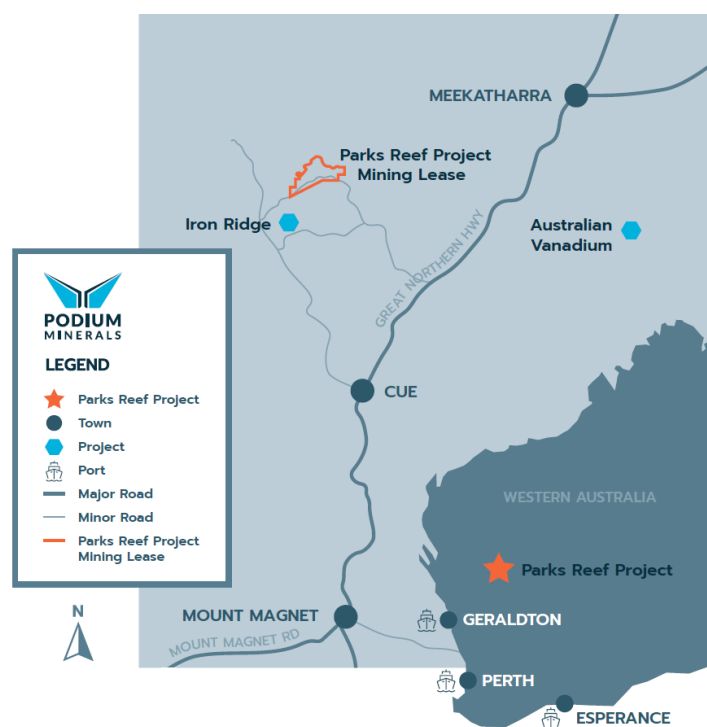
Figure 3. Location of the Parks Reef PGM Project 80km West of Meekatharra in Western Australia.

A successful and highly motivated technical and development team is accelerating Podium's strategy to prove and develop a high-value, long-life Australian PGM asset.