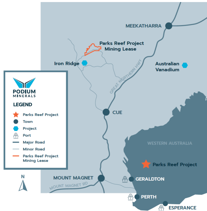
Figure 3. Location of the Parks Reef PGM Project 80km West of Meekatharra in Western Australia.

A successful and highly motivated technical and development team is accelerating Podium's strategy to prove and develop a high-value, long-life Australian PGM asset.