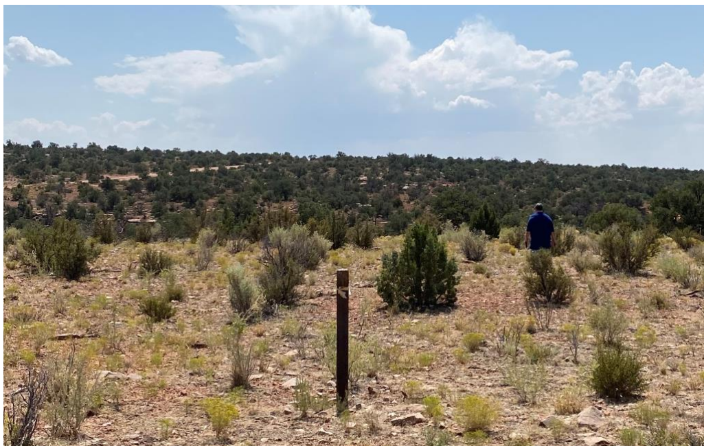
Figure 3: The cleared Mineral Canyon Fed 1-3 well pad, graded gravelled road in background.

The Mineral Canyon well is approximately 50 meters from Canyon Bottom Road, a graded gravelled county road and approximately 300 meters from the existing pipeline corridor. The original drill pad remains visible and can be re-established for the re-entry program (See Figure 3).