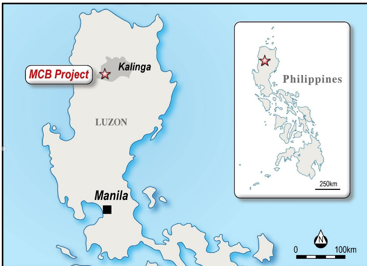
Figure 3. Location of the MCB Project in the province of Kalinga, Northern Luzon, Philippines.

Highlights from the Scoping Study include a Post tax NPV (8%) of US$464m and IRR of 31, assuming a copper price of US$4.00/lb and gold price of US$1,695/oz. Initial capital expenditure is estimated to be US$253m with a payback period of approximately 2.7 years. The designed mine production is matched to a 2.28Mtpa processing plant which will treat ore with an estimated average grade of 1.14% copper and 0.54g/t gold for the first 10 years of planned production with a C1 cash costs at just US$0.73/lb copper, net gold credits.