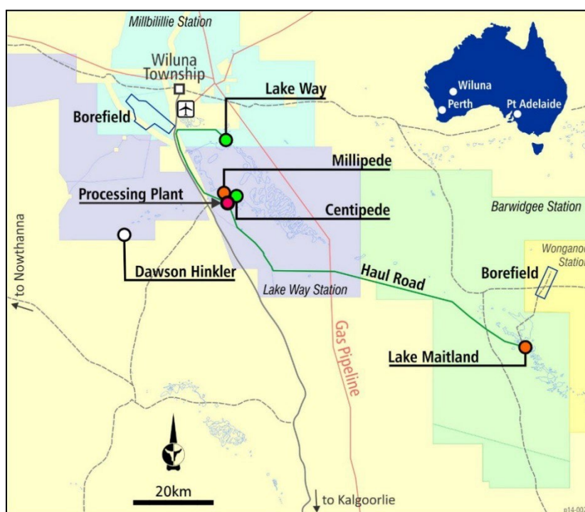
Figure 1: Wiluna Uranium Project

During the year the Company continued to improve the value of its Wiluna Uranium Project located 30 kilometres to the south of the town of Wiluna, which is located 750 kilometres north-east of Perth ( Figure 1 ) through research, innovation and engineering opportunities. The Company's efforts in this regard include proposed changes to the processing flowsheet design which have resulted in potential improvements in the capital and operating costs of the Wiluna Uranium Project as well as a potential improvement in overall uranium recovery from the plant, as detailed below. The changes have resulted from the opportunities highlighted by the test work completed as part of the Beneficiation and Process Design studies ( BPD Studies ) that have been ongoing since completion of the Company's 2016 Scoping Study.