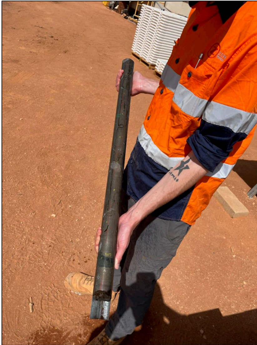
Figure 4: Diamond drill core of massive Ni-sulphide intersected in TED42, the follow-up hole to the Dimma discovery hole, TED41. See text for further details.