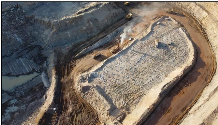
Figure 1. Grade control drilling ore at base of Grants Stage 1

The crushing and screening plant is on track for commissioning ahead of the DSO sale. A nightshift has been implemented to accelerate construction of the Dense Media Separation (DMS) plant which is on track to support spodumene concentrate production in H1 2023.