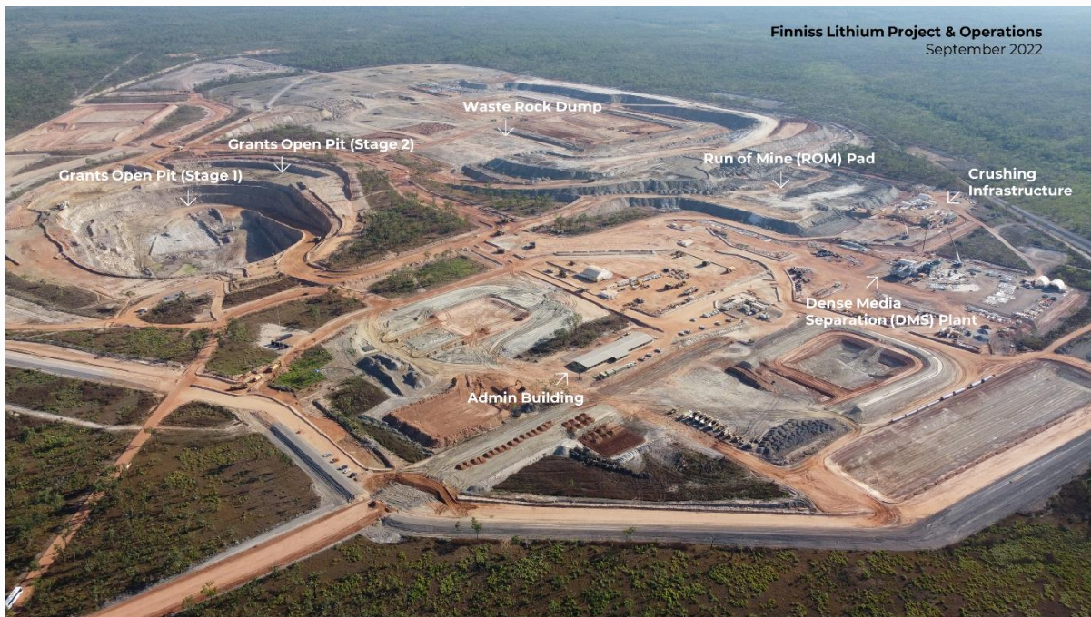
Figure 3. Finniss Lithium Project and Operations Progress (looking south)