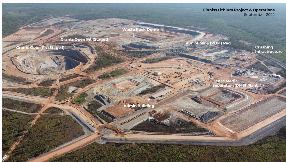
Figure 3. Finniss Lithium Project and Operations Progress (looking south)