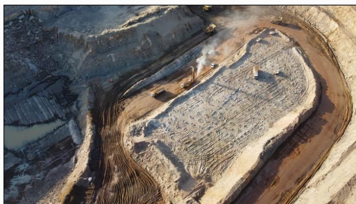
Figure 1. Grade control drilling ore at base of Grants Stage 1

The crushing and screening plant is on track for commissioning ahead of the DSO sale. A nightshift has been implemented to accelerate construction of the Dense Media Separation (DMS) plant which is on track to support spodumene concentrate production in H1 2023.