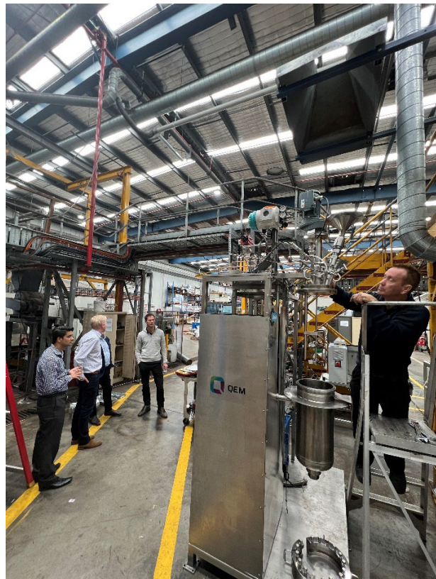
QEM's bench-scale pilot plant operating at HRL's headquarters in Melbourne.

As with the T1 test, the solvent extraction test work in the second T2 round involved heating a slurry of oil shale and solvent to achieve the targeted autoclave temperature. Under these supercritical conditions, the kerogen in the shale is converted to liquid and gaseous products.