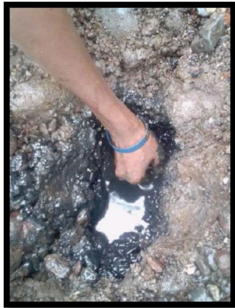
Figure 2. Oil seep observed on West Fergusson Island early 2022