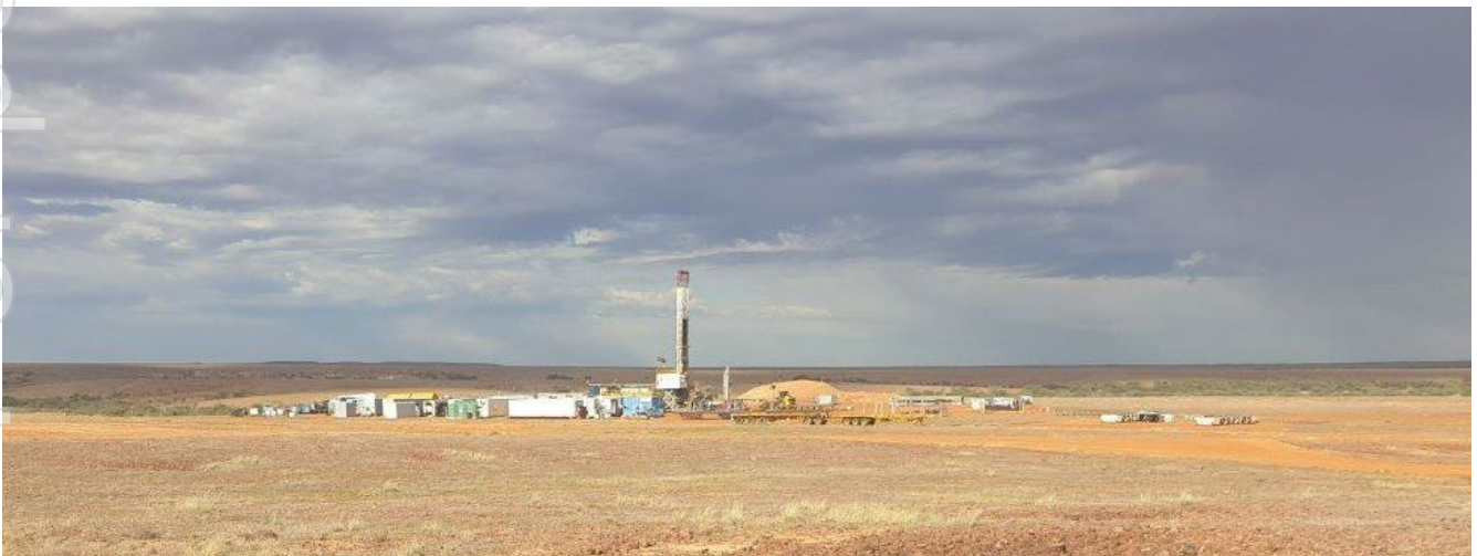
Figure 2: Yarrow Well activity at Innamincka Project - 15 September 2022