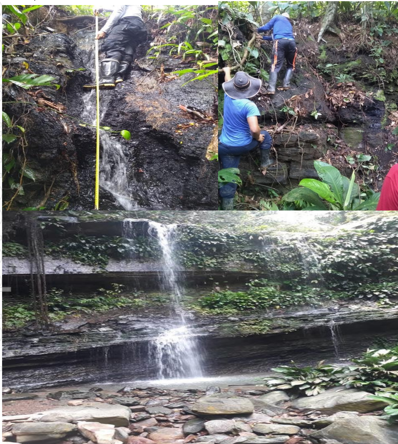
(Figures 1, 2 & 3 – Coal seam outcrops - Vetás Project)