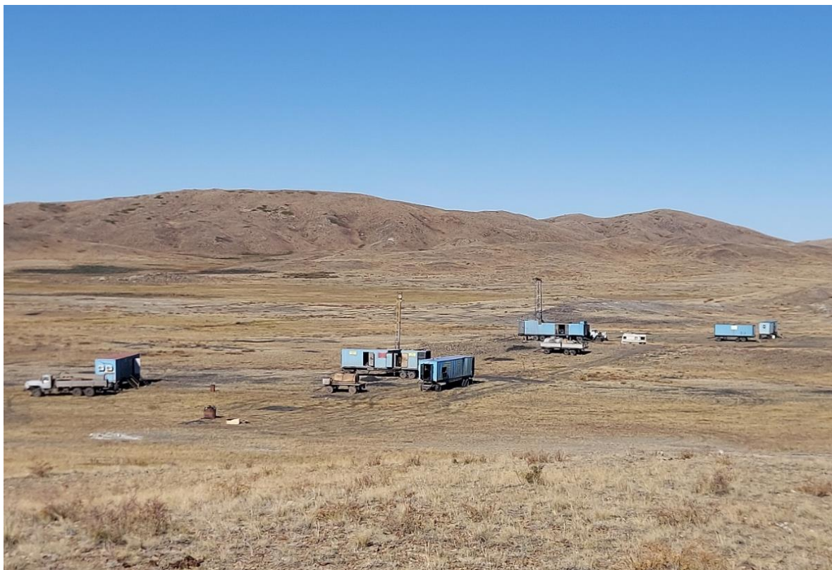
Figure 1 – Two diamond drill rigs and support equipment at the Central Graphite Zone, Sarytogan Graphite Deposit.