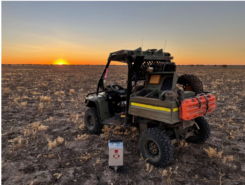
Figure 1: Gator Utility Terrain Vehicle alongside a CG5 Gravity Meter

Strategic Energy Resources (“SER” or “the Company”) is pleased to announce that a detailed ground gravity survey has commenced over the northern section of the Canobie Domain in northwest Queensland (Fig. 1). SER’s Canobie Project comprises eight exploration licences covering over 1,800km 2 within the Mt Isa Eastern Succession, bounded to the east by the Quamby fault/Gidyea Suture Zone. The Eastern Succession hosts several significant deposits to the south including Evolution Mining’s Ernest Henry Copper-Gold mine.