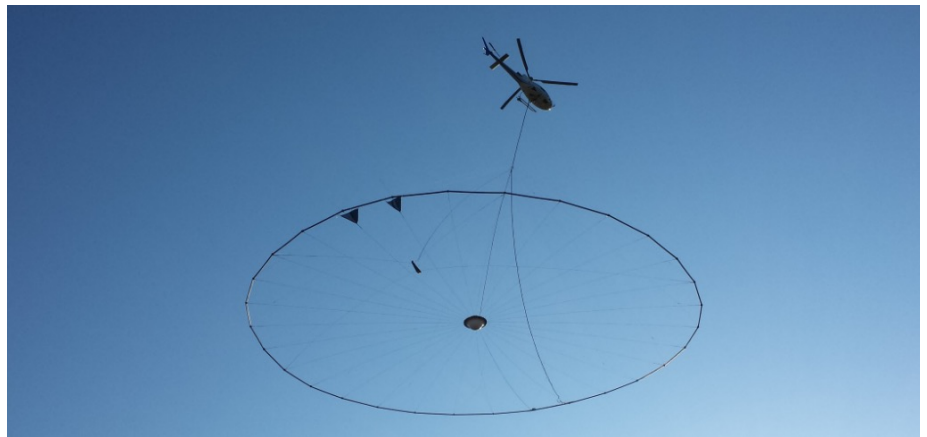
HelITEM 2 helicopter time-domain AEM Survey

The Board of Directors of Coolabah Metals Limited authorised the release of this announcement.