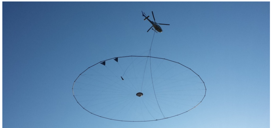
HelITEM 2 helicopter time-domain AEM Survey

The Board of Directors of Coolabah Metals Limited authorised the release of this announcement.