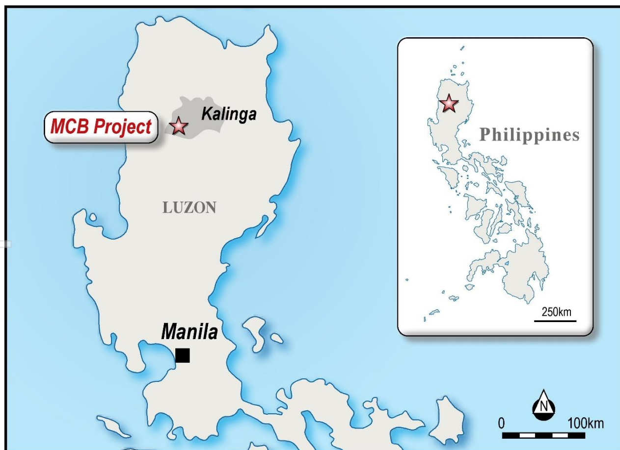
Figure 1. Location of the MCB Project in the province of Kalinga, Northern Luzon, Philippines.

Highlights from the Scoping Study include a Post tax NPV (8%) of US$464m and IRR of 35%, assuming a copper price of US$4.00/lb and gold price of US$1,695/oz. Initial capital expenditure is estimated to be US$253m with a payback period of approximately 2.7 years. The designed mine production is matched to a 2.28Mtpa processing plant which will treat ore with an estimated average grade of 1.14% copper and 0.54g/t gold for the first 10 years of planned production with a C1 cash costs at just US$0.73/lb copper, net gold credits.