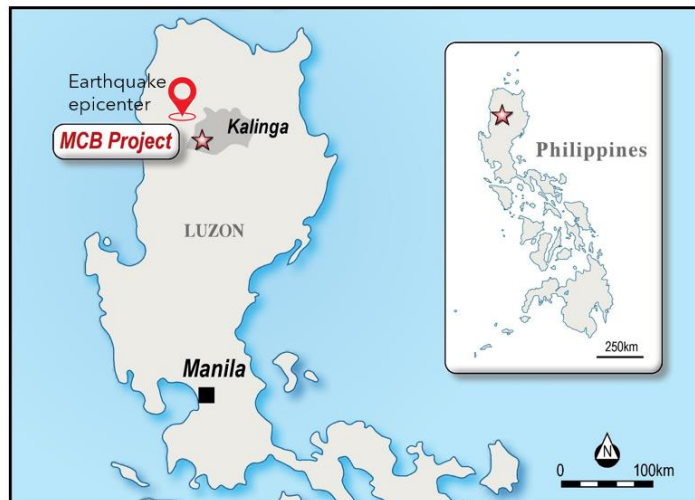
Figure 4: Location of the MCB Project in the province of Kalinga, Northern Luzon, Philippines in relation to the Earthquake Epicenter in Dolores, Abra