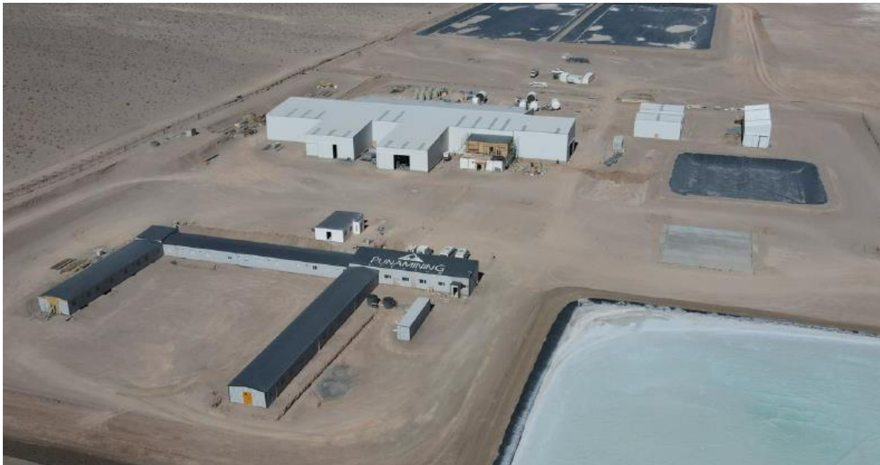
Figure 1. Rincon Lithium Project – 2,000tpa Operation Site Works

Upon completion of the construction phase works, plant commissioning, and production test-works, the Company's ramp-up to 2,000tpa operations will proceed immediately thereafter.