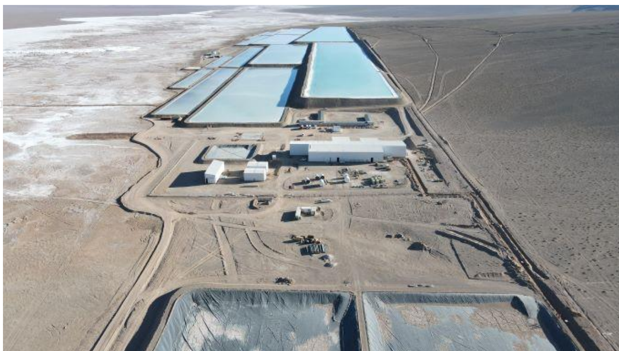
Figure 6. Rincon Lithium Project – 2,000tpa Operation Site Works