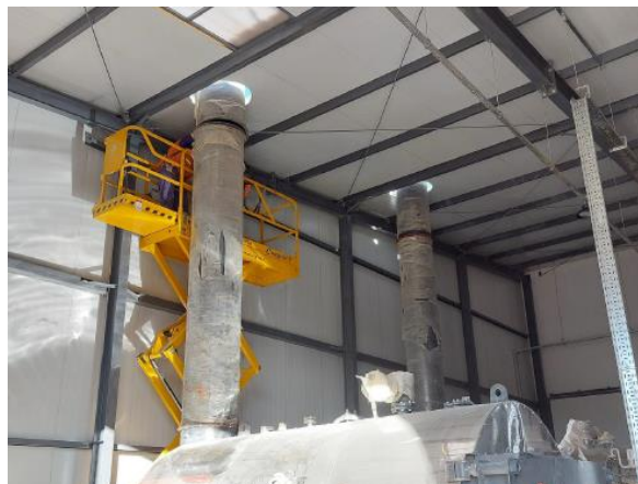
Figures 2-3. Rincon Lithium Project – 2,000tpa Operation Site Works