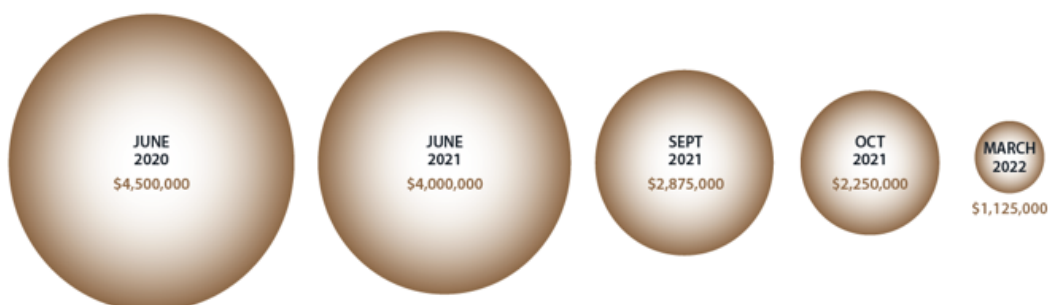
BONEYARD LOAN BALANCE

This announcement was approved for release by the Board of Atlas Pearls Ltd.