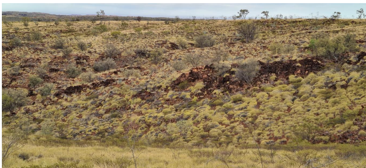
Photo 1: Surface outcrop composite sample at the Braeside West prospect, Woodie Woodie North Manganese Project