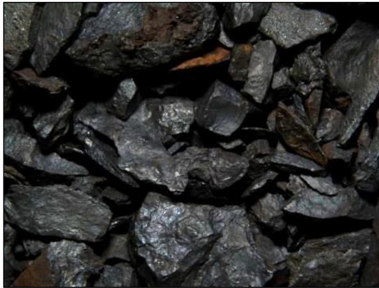
Figure 1: Photograph of the Braeside West prospect Heavy Media Separation bulk sample material