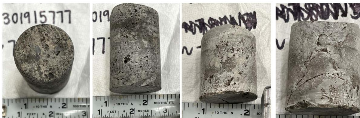
Big Flat Unit 1

Recently discovered Diamond core shows fracturing & "vugs" throughout the limestone and dolomite units demonstrating the high porosity required for the storage of brine, see Figure 3. This confirms the geophysical logs and porosity calculation (See ASX announcement 17 June, 2019).