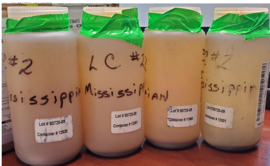
Figure 2: The brine samples on arrival at SGS Laboratories in Texas, USA.

The supersaturated brine samples from the drilled zone at Long Canyon No. 2 were sent to SGS North America (Oil, Gas and Chemical Division) in Texas for laboratory analysis (see Figure 2). The laboratory specialises in brines which can be associated with the oil industry, and is the laboratory that all samples from Anson's previous drilling programs at Paradox have been sent.