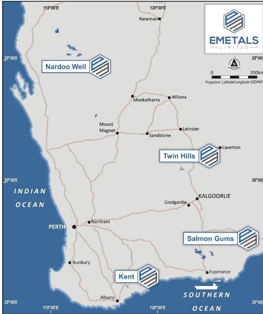
Figure 1 – EMT Projects

including aero magnetics, gravity and radiometric. In some cases, this work was followed up by limited soil geochemistry, but no anomalies of significance were defined. Most significantly several of the early explorers completed shallow drill evaluation of various targets.