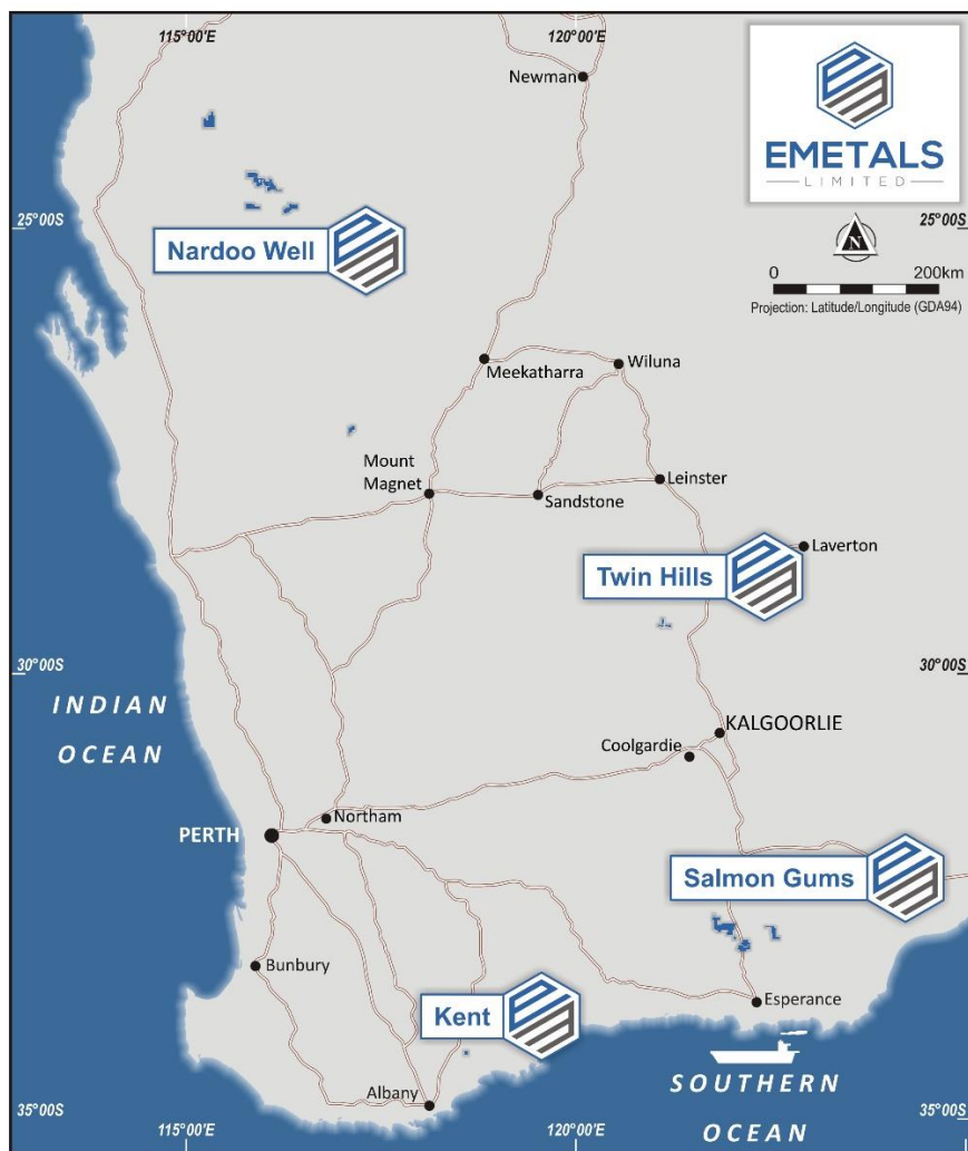
Figure 1 – EMT Projects

including aero magnetics, gravity and radiometric. In some cases, this work was followed up by limited soil geochemistry, but no anomalies of significance were defined. Most significantly several of the early explorers completed shallow drill evaluation of various targets.