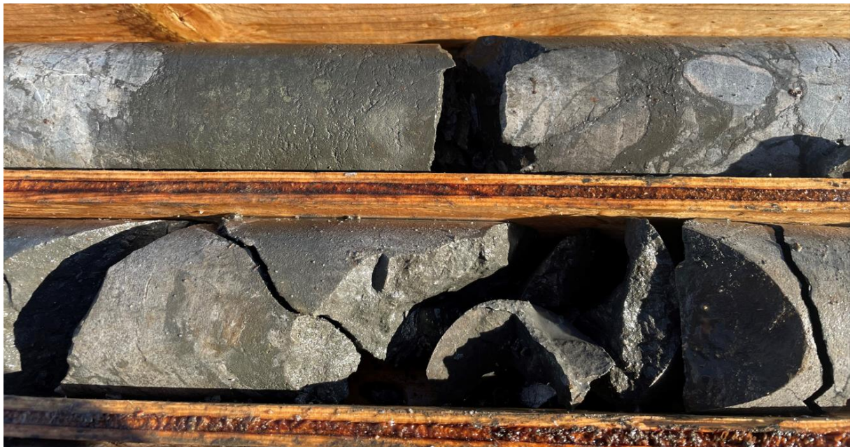
Figure 1: Massive and breccia chalcocite (dark grey) from approximately 36m downhole in drill hole ST22-01.