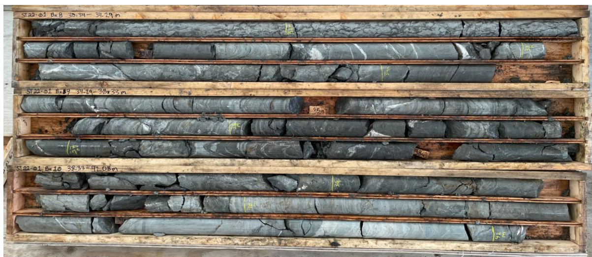
Figure 4: Drill core from ST22-01 between 30.34 – 42.08m downhole showing massive and breccia chalcocite (dark grey) hosted within dolomite (pale grey)

Table 1 summarises the mineralisation as observed in ST22-01. Intersections are expressed as downhole widths and are interpreted to be close to true widths. Visual estimates of sulphide quantity and habit should not be considered a substitute for laboratory assays. Laboratory assays are required to determine the widths and grade of mineralisation as reported in preliminary geological logging.