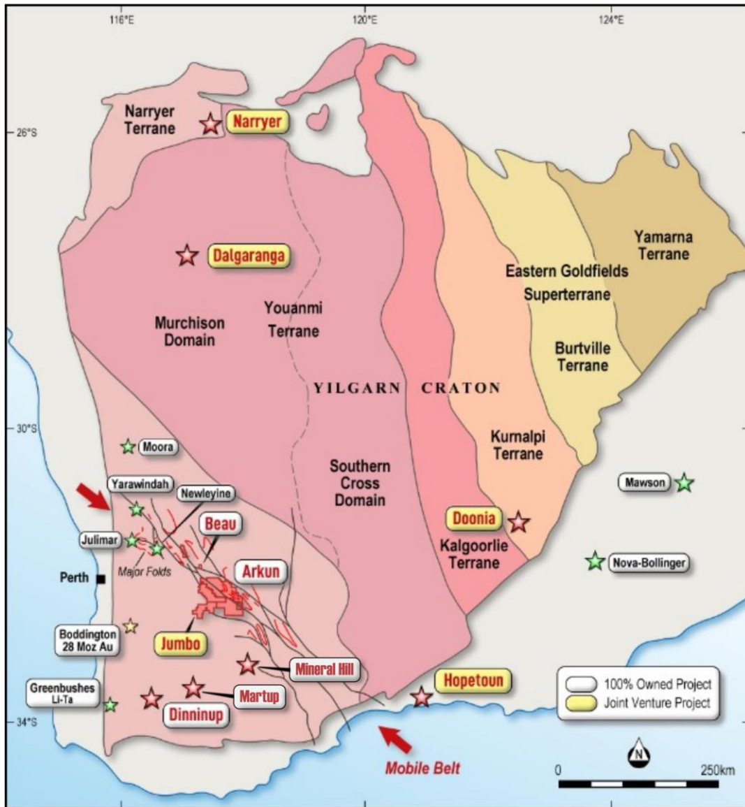
Figure 1. Location of Impact's projects in Western Australia.

The following work has recently been completed across the Arkun-Beau-Jumbo Project areas: