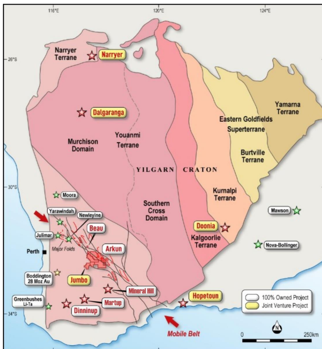
Figure 1. Location of Impact's projects in Western Australia.

The following work has recently been completed across the Arkun-Beau-Jumbo Project areas: