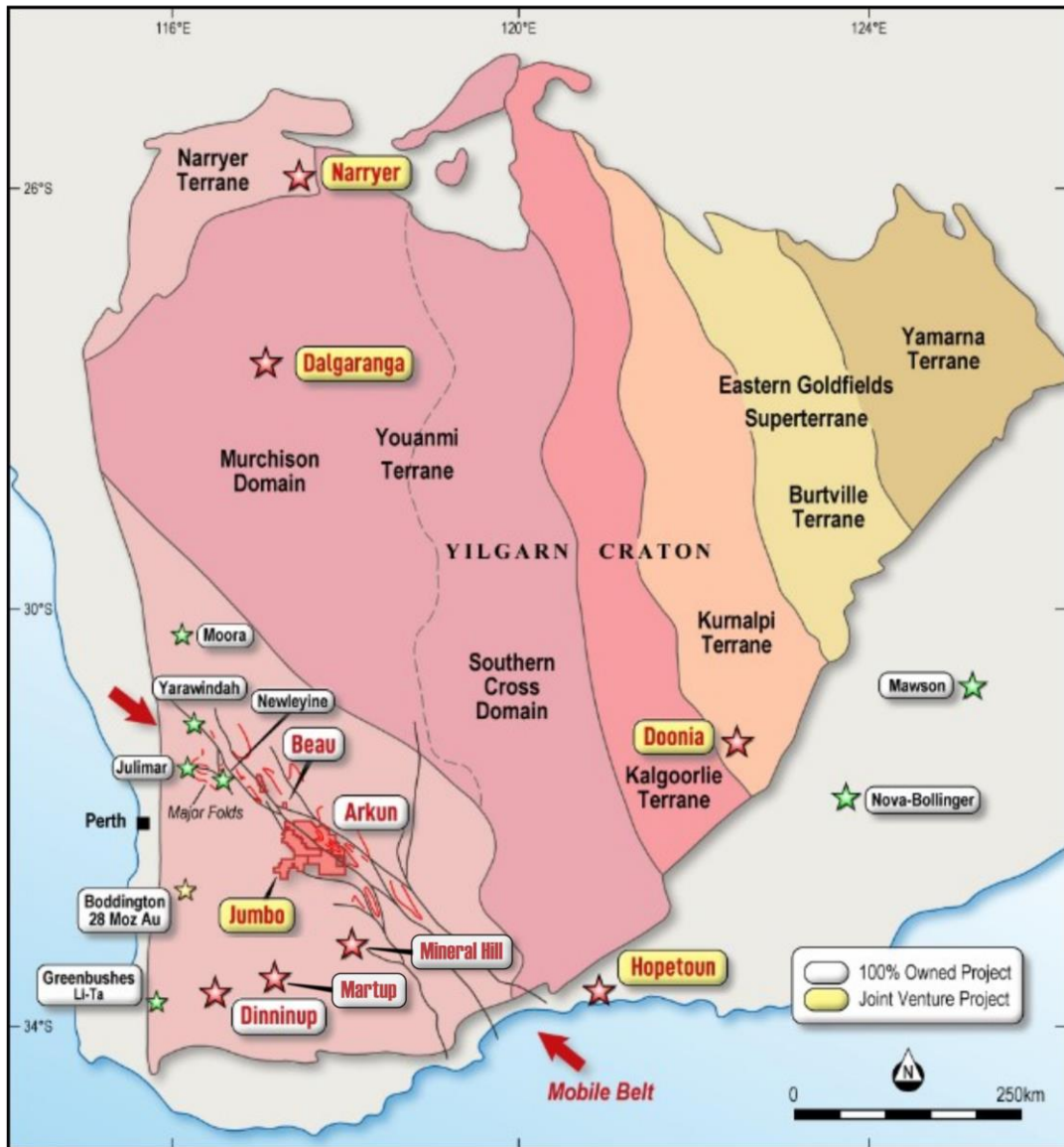
Figure 1. Location of Impact's projects in Western Australia.

The following work has recently been completed across the Arkun-Beau-Jumbo Project areas: