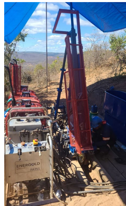
Figure 1: New diamond drilling rig on site at Colina

Latin is pleased to announce that it has secured additional exploration rights covering the area directly along strike to the south of the high-grade Colina Project ( Figure 2 and Figure 3 ), where drilling has confirmed the presence of thick, high-grade, near surface pegmatites. The new option agreement extends the Company’s 100% tenure a further 1.2 kilometres to the south, where drilling shows the pegmatites remain open, with the southern most drillhole targeting the main pegmatites, SADD006, returning an intersection of 21.1m @ 1.2%Li 2 O 1 .