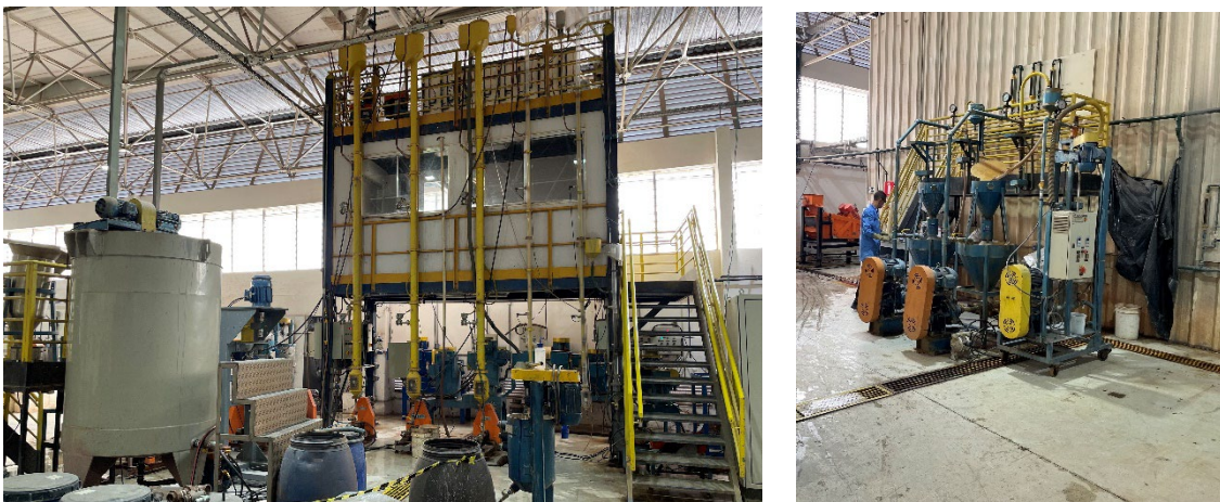
Figure 4: Metallurgical laboratory showing DMS and flotation columns and other equipment, Belo Horizonte, Brazil

The Company can confirm that samples have now been received at the SGS laboratory in Brazil, enabling the commencement of the planned preliminary metallurgical test work on the Colina lithium pegmatite. The planned test work will include Dense Media Separation (“DMS”) and flotation testing to determine lithium recovery into final concentrates, and detailed mineralogical and petrological studies to confirm individual miner species present in the Colina pegmatite.