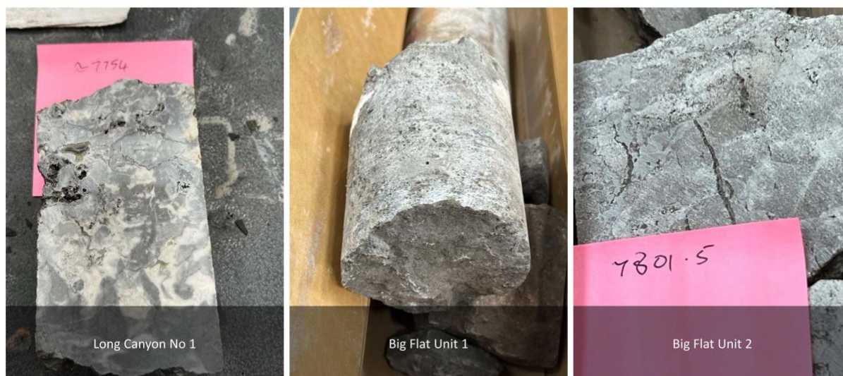
Figure 2: Pictures of Diamond Core Plugs from wells that sampled the Mississippian Units.

Diamond core recently discovered shows fracturing and "vugs" throughout the limestone and dolomite units, demonstrating the high porosity required for the storage of brine (see Figure 2). This confirms the geophysical logs and porosity calculation (see ASX announcement 17 June, 2019 ).