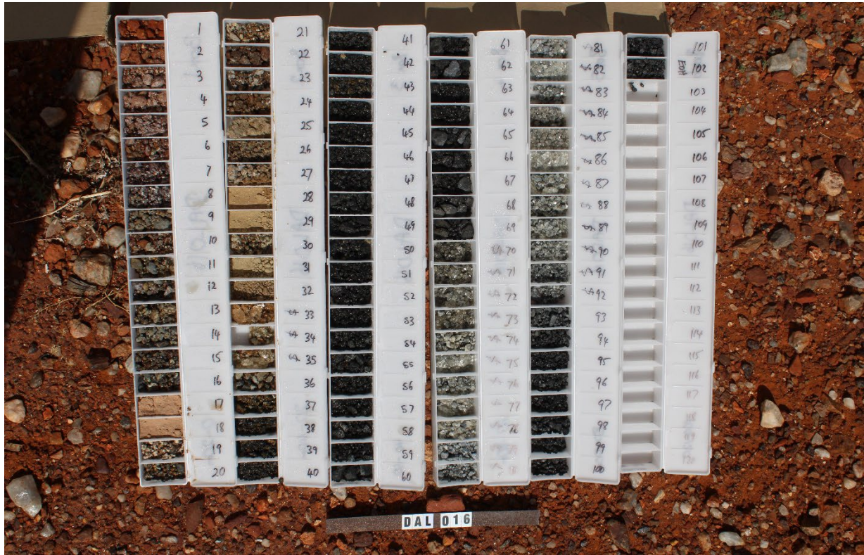
Figure 3 Photograph of sample chip trays for DAL016 showing zones of pegmatite intersections (typically light silver white colour).