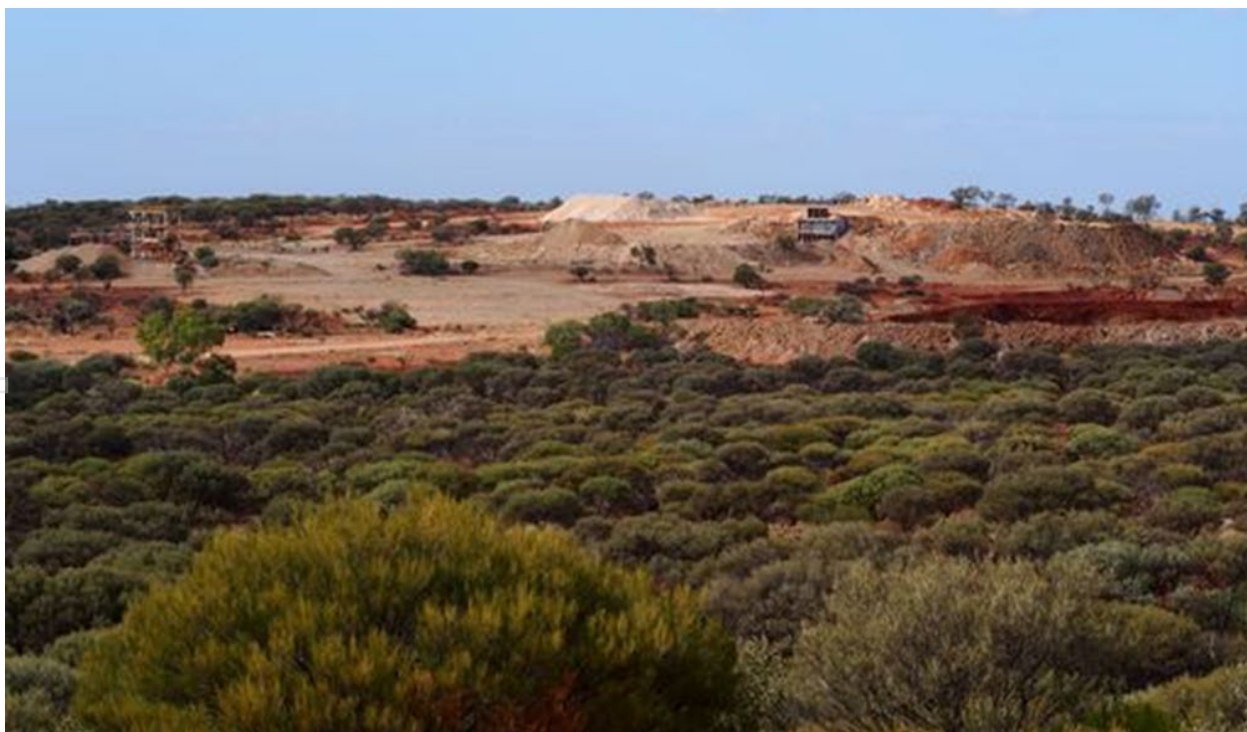
Figure 1: Looking south over area of major concentration of drilling (middle ground), showing pit bunding (centre right), with remnant ore and plant area shown (back ground).

Krakatoa Resources Limited (ASX: KTA) ("Krakatoa" or the "Company") is pleased to inform the market that resource drilling has been completed at its 100% owned Dalgara critical metals project located approximately 70km from Mt Magnet, WA.