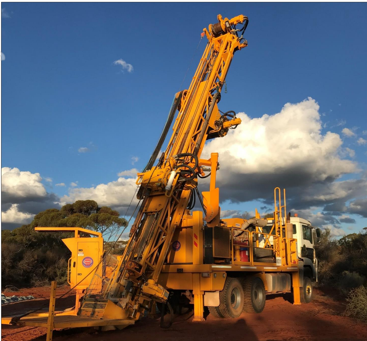
Figure 3 – Mt Magnet Drilling diamond rig at the Manna site

“We are pleased to report positive initial results from the RC drilling program at the Manna Lithium Project and at the same time announce our DD program has now commenced. It is an exciting time for the Company to have both the RC and DD programs progressing together backed by the confidence that these positive early assay results, which extend the orebody at depth, have delivered.”