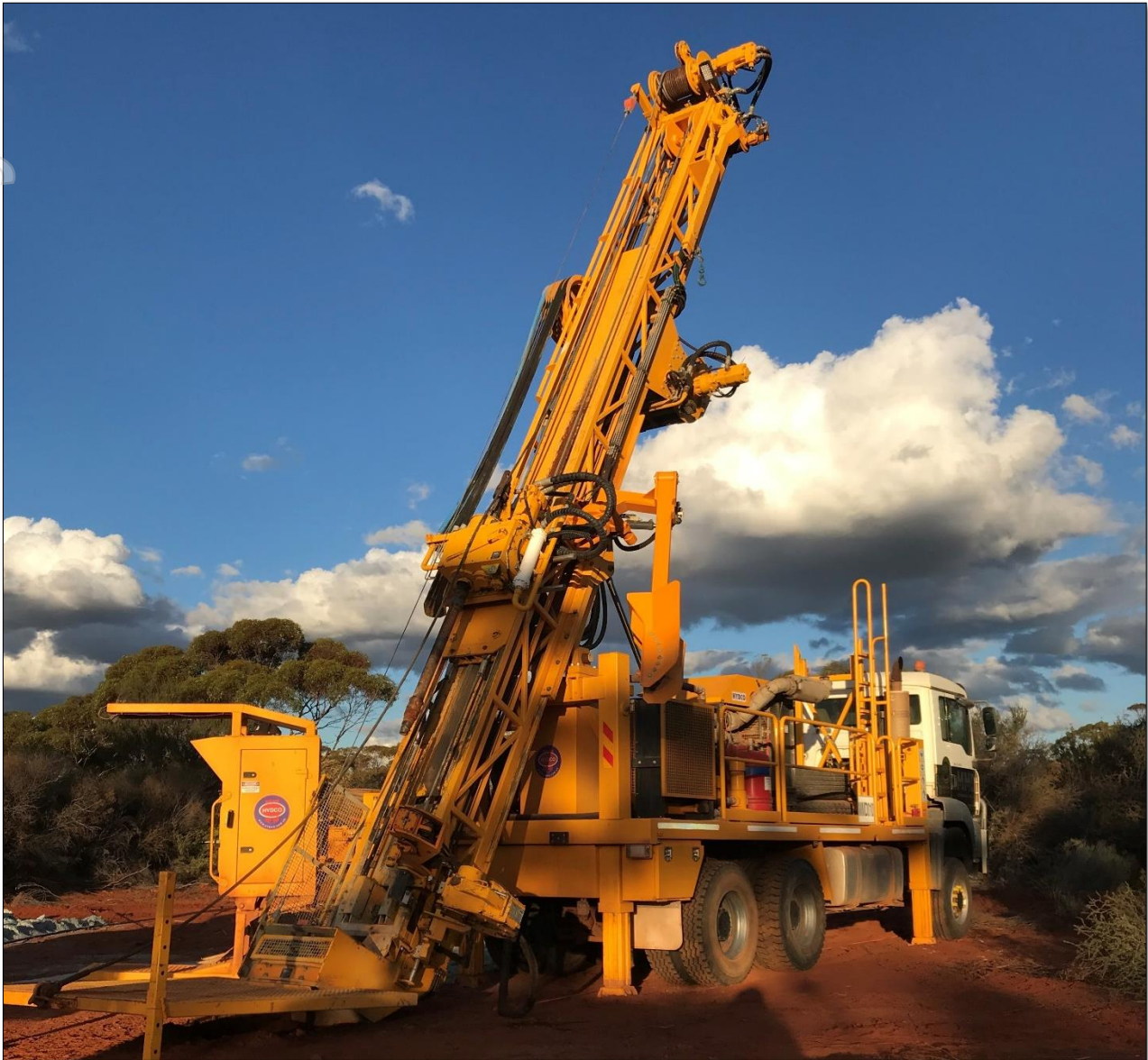
Figure 3 – Mt Magnet Drilling diamond rig at the Manna site