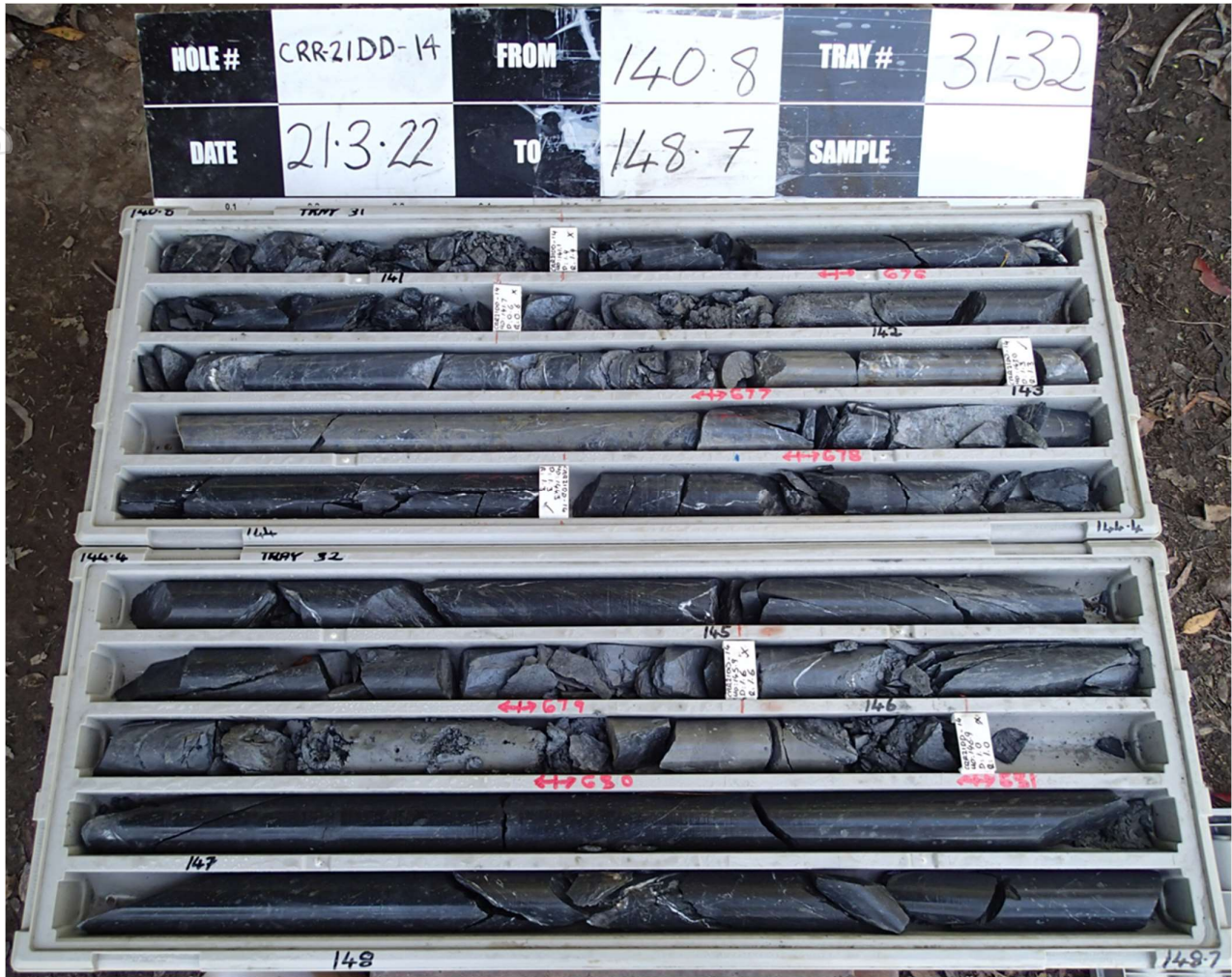
Figure 2: CRR21DD_014, detail from above Figure 1 of Sample (42)680 (146.51-146.90m downhole) exhibiting extensive massive sulphide – sample assayed 31.30% Zn, 18.30% Pb, 0.60% Cu, 59.30g/t Ag (NQ core, 50mm diameter)