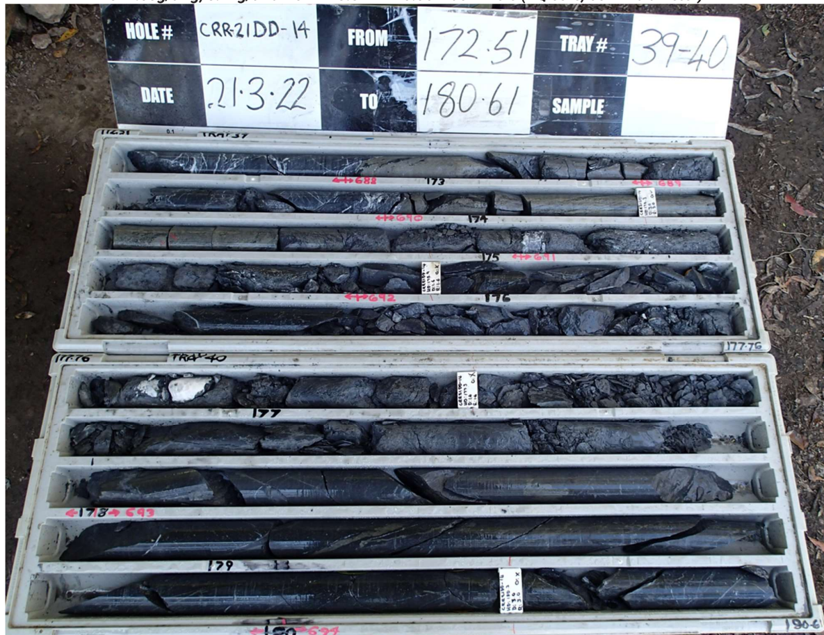
Figure 4: CRR21DD_014, detail from above Figure 3 of Sample (42)690 (173.84-175.06m downhole) exhibiting extensive banded, massive sulphide – sample assayed 25.40% Zn, 15.50% Pb, 3.46% Cu, 394.00g/t Ag, 0.44g/t Au (NQ core, 50mm diameter)