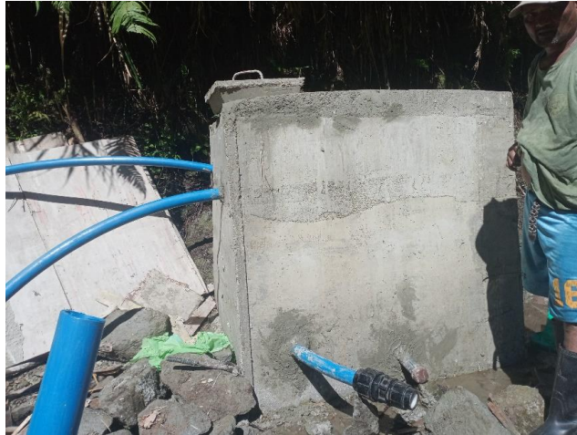
Photos 2&3 Newly-constructed water distribution tank (left) and intake tank (right)

The company continues to support educational initiatives in conjunction with the Department of Education. This includes alternative modes of learning to enable students to continue their education despite the challenges of the Covid Pandemic. This includes the installation of a local area network at the local high school.