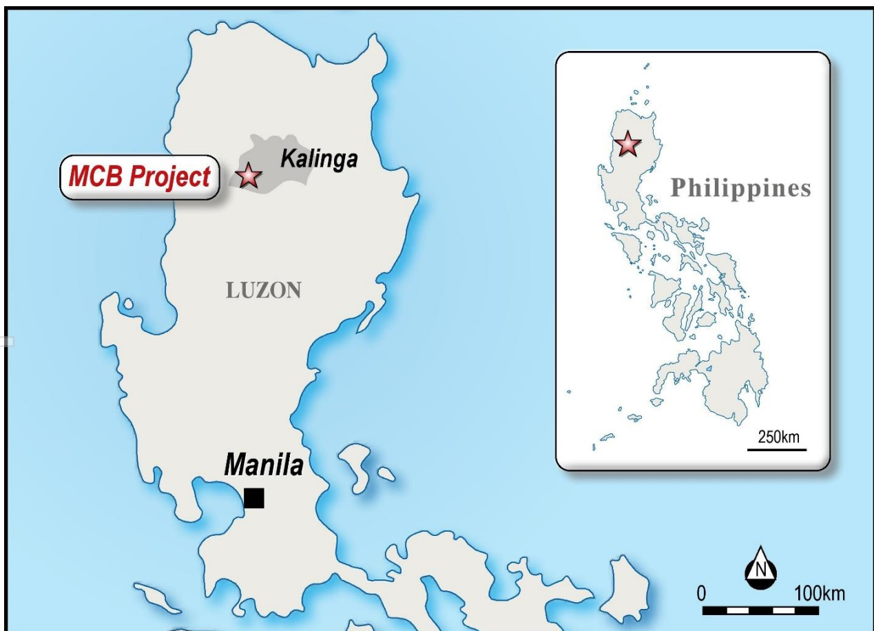
Figure 3: Location of the MCB Project in the province of Kalinga, Northern Luzon, Philippines.

Highlights from the Scoping Study include a Post tax NPV (8%) of US$464m and IRR of 35%, assuming a copper price of US$4.00/lb and gold price of US$1,695/oz. Initial capital expenditure is estimated to be US$253m with a payback period of approximately 2.7 years. The designed mine production is matched to a 2.28Mtpa processing plant which will treat ore with an estimated average grade of 1.14% copper and 0.54g/t gold for the first 10 years of planned production with a C1 cash costs at just US$0.73/lb copper, net gold credits