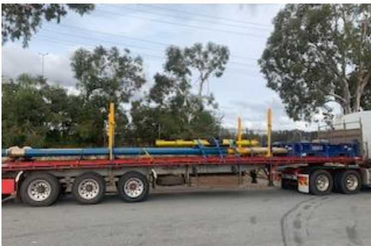
Drilling bottom hole assembly headed to Dampier from Perth