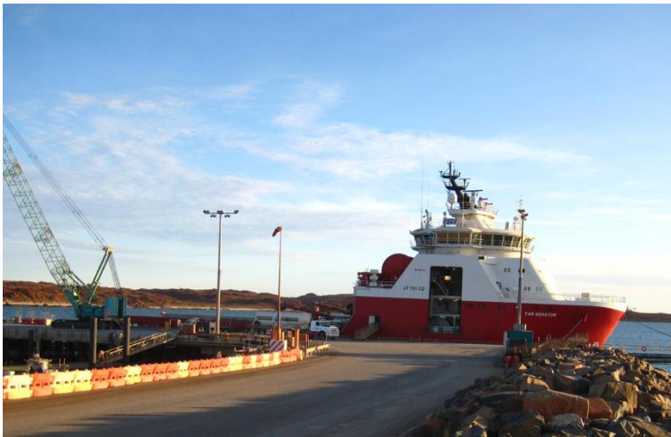
Solstad Far Senator anchor handling support vessel loading at Dampier Wharf