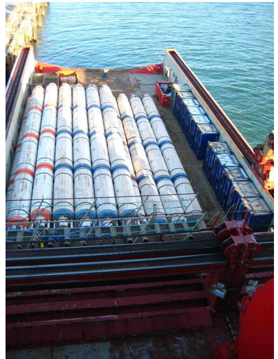
Marine riser loaded on the Far Senator