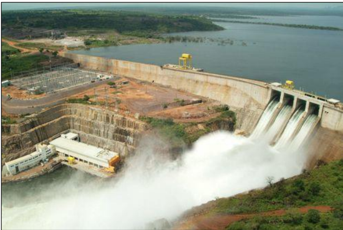
Figure 3 - Capunda Dam with hydroelectric plant and associated power infrastructure.

For Angolan agricultural industries, the current situation involves the importation of ammonia and/or fertilizer. Transportation and internal handling costs currently comprise ~45% of the cost of landed product in Angola. By developing a green ammonia facility close to end markets, there is a significant margin that can be captured whilst remaining competitive with alternative sources. Low-priced and abundant power supplies make locally produced green ammonia significantly more attractive than imported ammonia (Fig. 3).