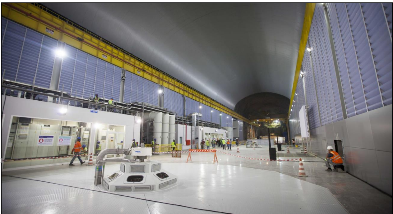
Figure 4 - Laúca Hydroelectric Plant. A 2GW run-of-the-river hydroelectric project located on the Kwanza River and currently the second biggest hydroelectric power facility in operation in Africa.

Large-scale hydroelectric projects completed recently include the Laúca hydroelectric power station, a 2GW run-of-the-river hydroelectric project located on the Kwanza River that is currently the second biggest hydroelectric power facility in operation in Africa (Fig. 4), the Caculo Cabaça Hydroelectric Project, the Balalunga Project and several others throughout the southern region of the country.