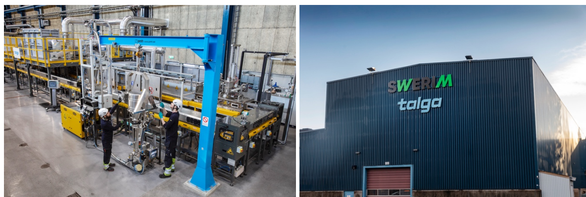
Figure 1 Talga's now-operational EVA plant in Luleå, northern Sweden.

Large-scale Talnode®-C samples will be shipped to battery cell makers to undergo next stage commercial testing. Talga has received engagements from 23 battery manufacturers and major automotive OEMs for qualification stage Talnode®-C samples produced at the EVA plant.