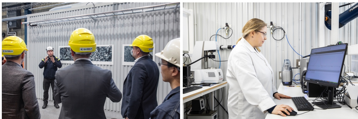
Figure 2 Technical presentation at Talga's EVA launch event (L) and QC laboratory at EVA (R).