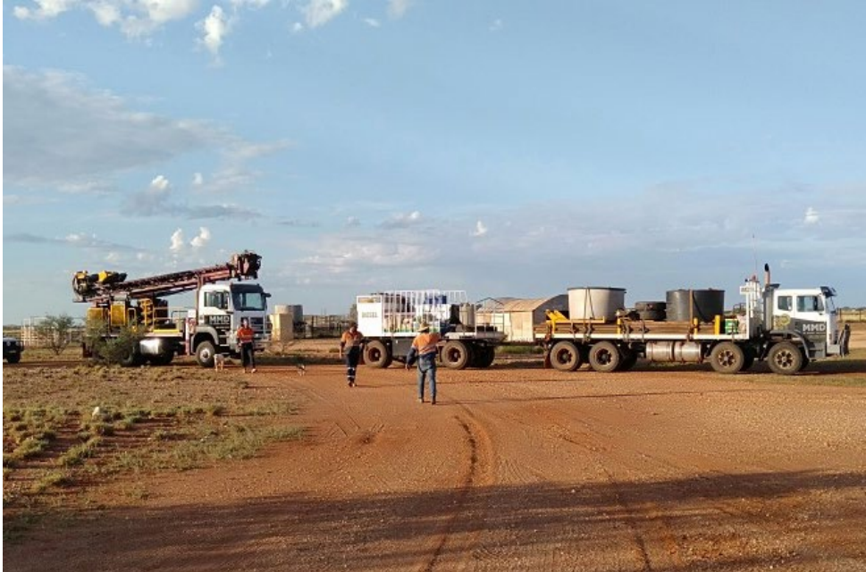
Figure 2 - Diamond Core rig arriving at Mallina

On 20 April 2022, a second drilling contractor arrived at the Mallina Project and commenced working through site safety management protocols and inductions in preparation for the commencement of diamond core drilling. The core program consists of 1,020m of drilling, will commence 22 April 2022 and is expected to be completed in four to five weeks.