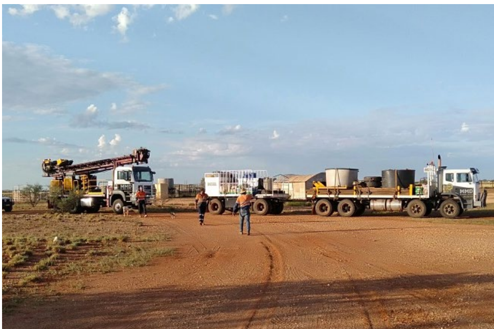
Figure 2 - Diamond Core rig arriving at Mallina

On 20 April 2022, a second drilling contractor arrived at the Mallina Project and commenced working through site safety management protocols and inductions in preparation for the commencement of diamond core drilling. The core program consists of 1,020m of drilling, will commence 22 April 2022 and is expected to be completed in four to five weeks.