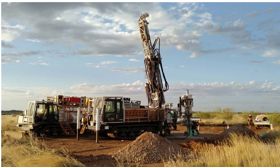
Figure 1 – RC rig drilling collar at hole DDH02

Following the establishment of a field camp in late March, the reverse circulation (RC) drill contractor mobilised to the Mallina Project in the second week of April. After completing site and safety management protocols and inductions, drilling work commenced on 18 April 2022. The RC program consists of three collars, each of approximately 150m, in preparation for diamond core tails to 470m. The RC program is expected to be completed within the next week.