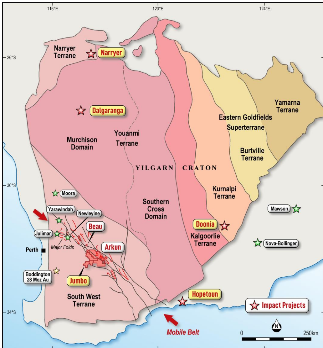
Figure 4. Location of Impact's projects in Western Australia.