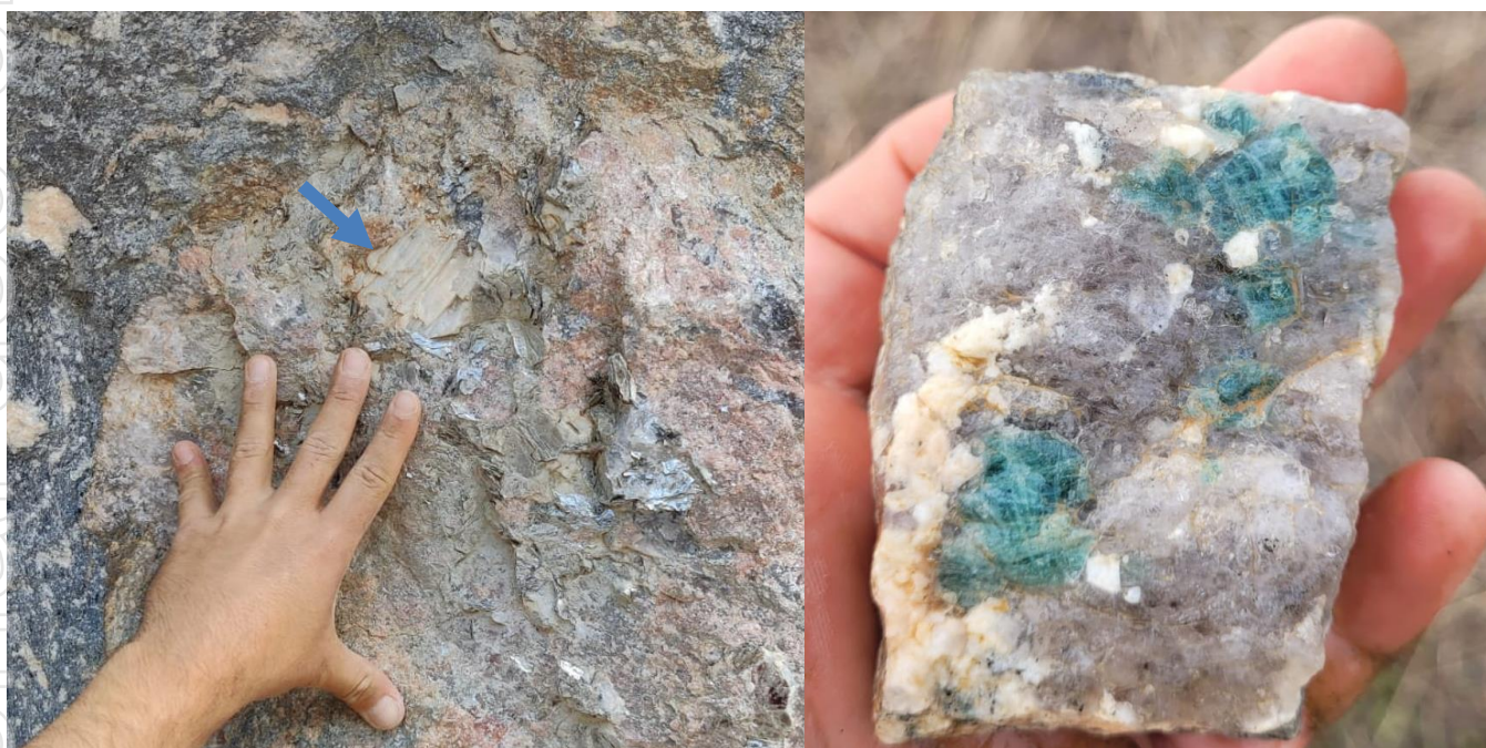
Figure 2. Outcrop of pegmatite vein with large spodumene crystal (arrow) and grab sample with yttrium-bearing apatite (aquamarine crystals).

Outcrops of pegmatite veins with large spodumene and apatite crystals have been identified at the Kalahari Prospect, part of Impact Minerals Limited's Hopetoun Project near the mining centre of Ravensthorpe in Western Australia (Figures 1, 2 and 3).