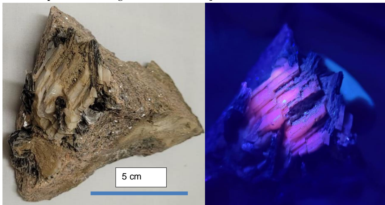
Figure 1. Large spodumene crystal in pegmatite vein (left) and under UV light showing the distinctive pink florescence of this lithium-bearing mineral.