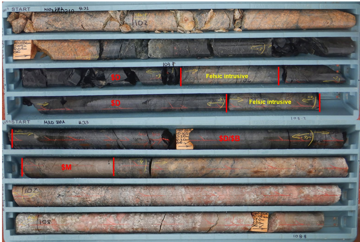
Figure 1 – drill core from MAD210 showing the mineralised intercept with granite contact. $D and $B refer to disseminated and blebby sulphides and $M refers to massive sulphides