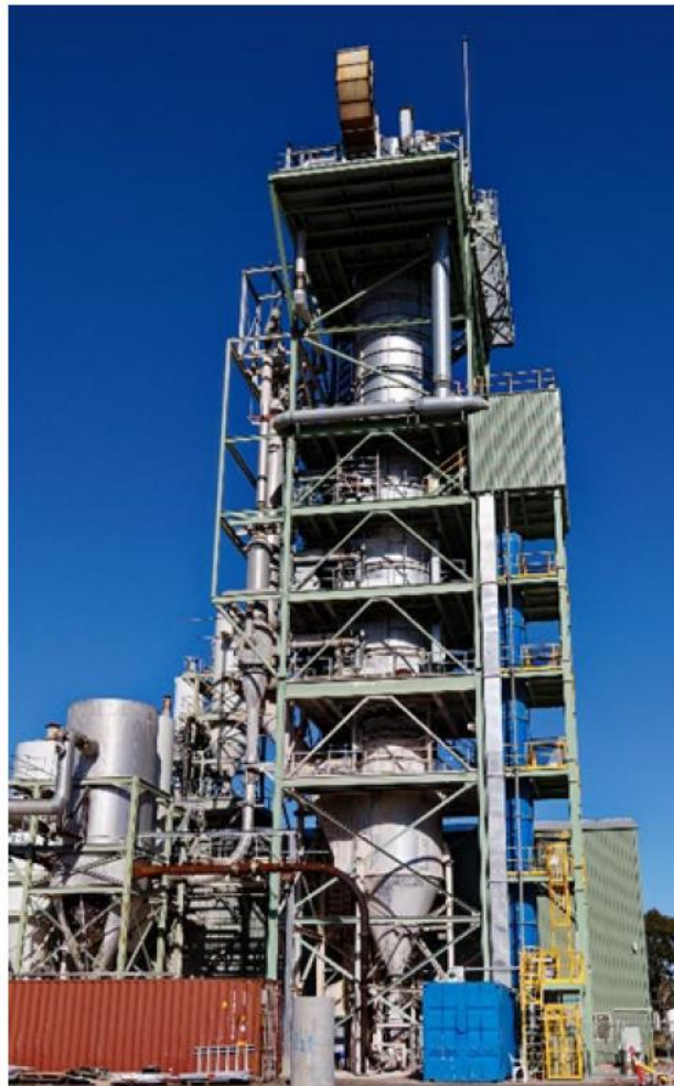
Figure 2 – Calix flash calciner and electric pilot scale plant (BATMn Reactor)

Further, the Calix flash calcination technique is particularly well-suited to the finer fraction of the fines flotation concentrate at Pilgangoora (less than 75 \mu m). This is very encouraging as it has the potential to solve an existing challenge for the industry when dealing with fine flotation products through conventional calcining technology.