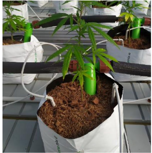
Images 1 & 2: Heat Exchange Probe deployed into pots (left) and grow bags (right) maintaining optimal root zone temperature