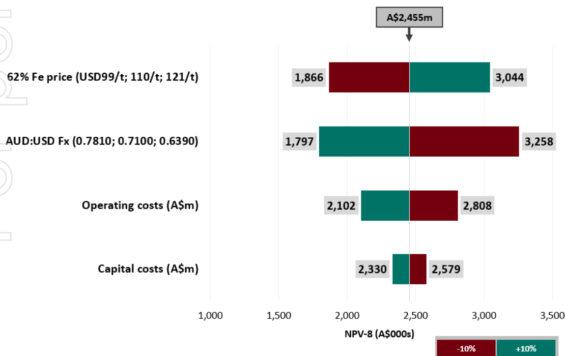
Table 9. NPV Sensitivity Analysis – Single-Step Expansion case