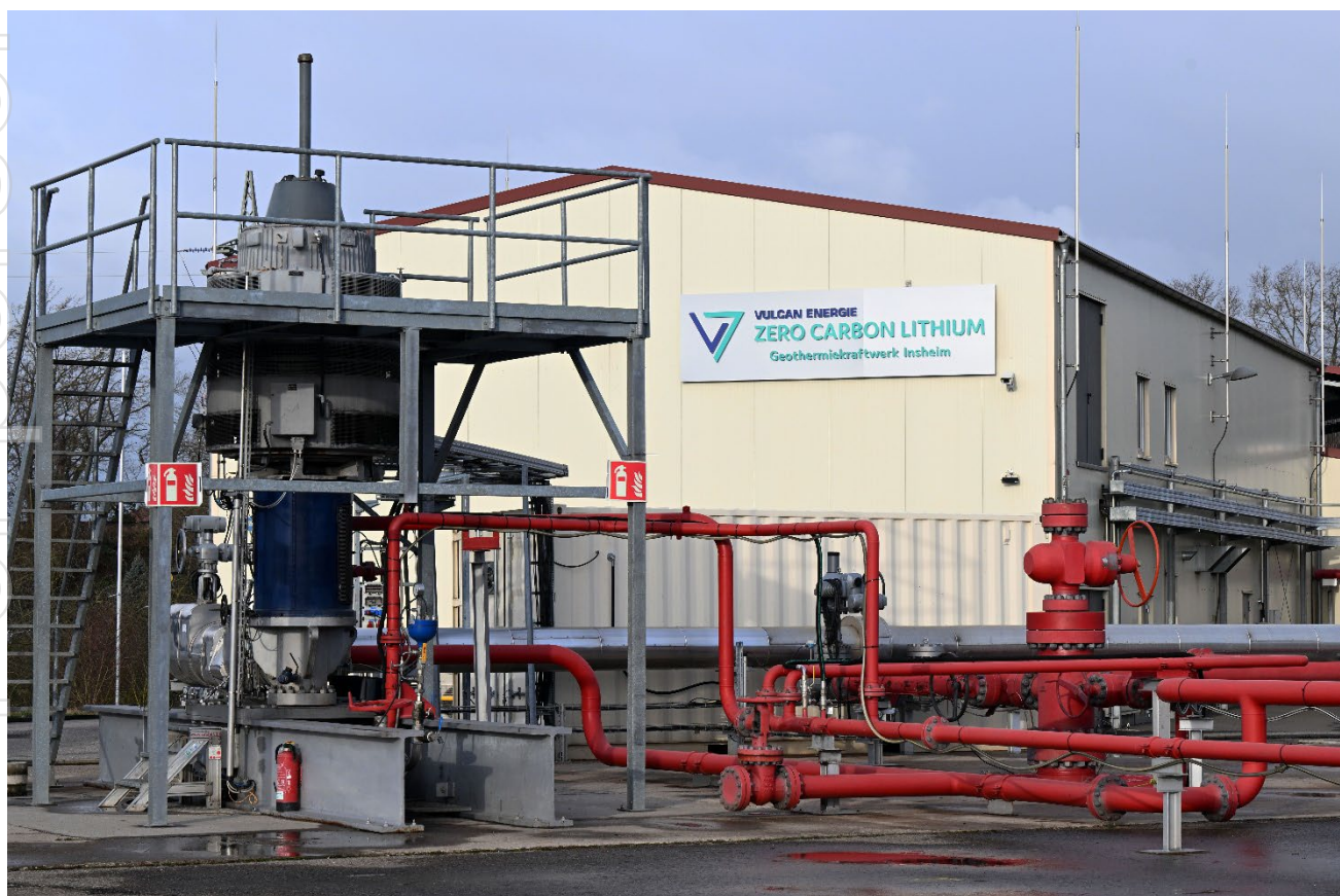
Vulcan's geothermal renewable energy plant, currently in commercial production

Vulcan acquired two electric drill rigs in November 2021 which can drill to the target depth required for geothermal energy wells in the Upper Rhine Valley, Germany. Refurbishment of the drill rigs has commenced to ensure optimal safety and efficiency during operation. Vulcan's two deep drilling rigs are a scarce, strategic asset for Vulcan, at a time when Germany is seeking to decarbonise its heating and deploy widespread deep geothermal development.