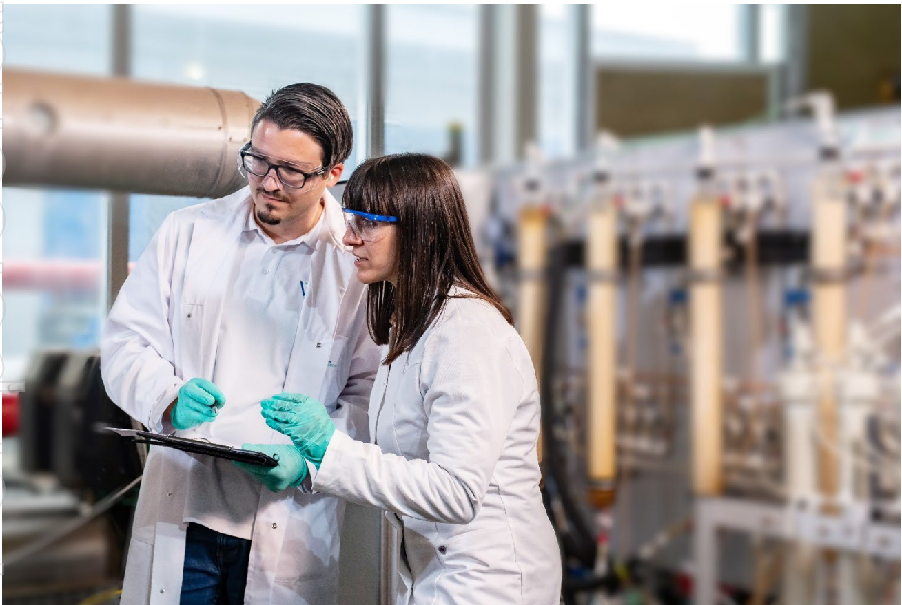
Vulcan's DLE Pilot Plant, successfully in operation for 12 months

This thorough test work produces crucial data needed for de-risking the lithium extraction process. Consistent lithium concentration and low level of impurities are being reported, together with lithium recovery rates averaging 94-95%, which are above the levels noted in the 2021 Pre-Feasibility Study.