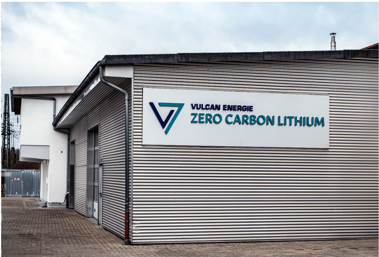
Vulcan's newly opened laboratory in Durlach-Karlsruhe